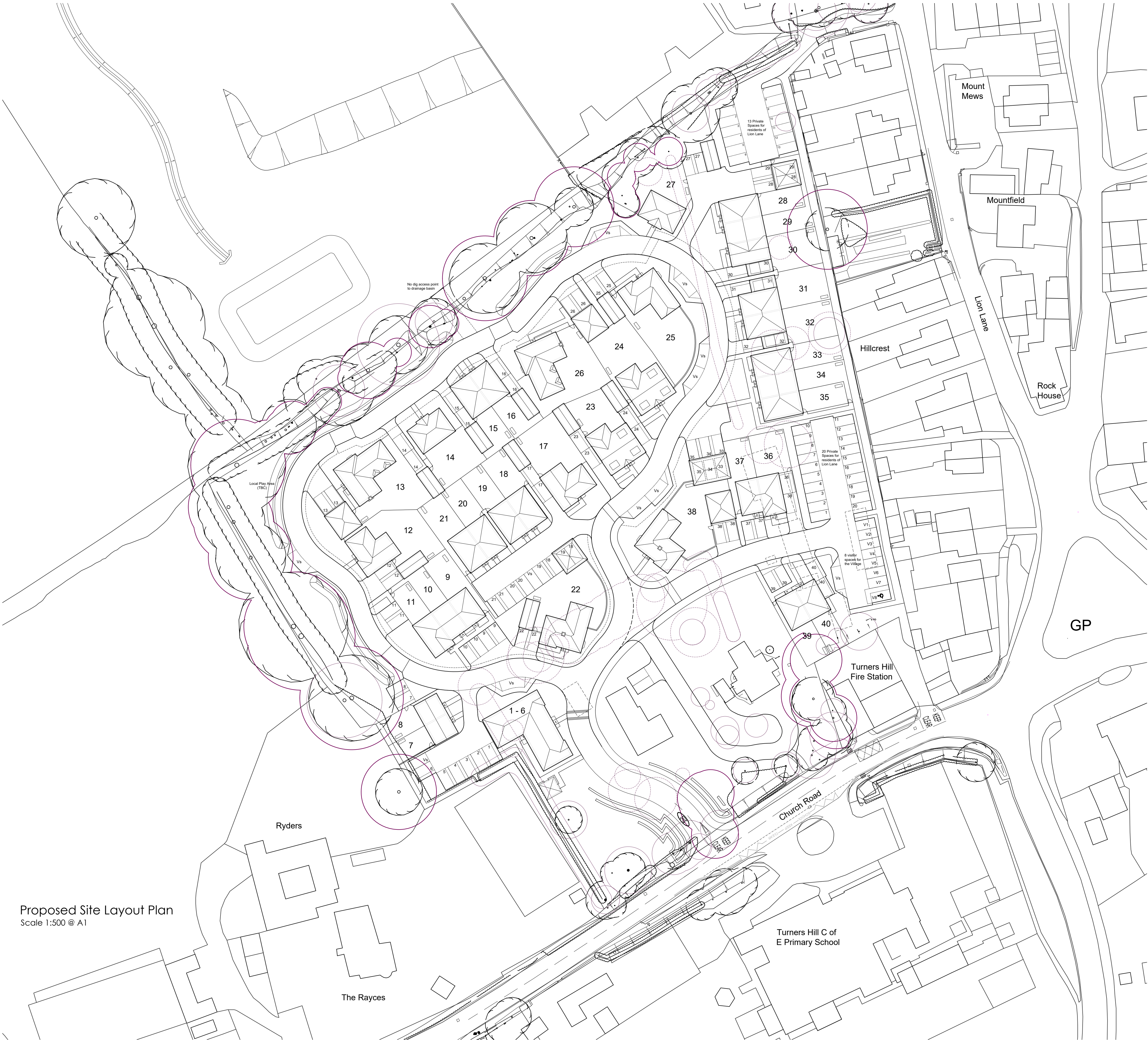
Proposed Site Layout Plan Scale 1:500 @ A1

This drawing and the design are the copyright of ON Architecture Ltd only. This drawing should not be copied or reproduced without written consent. All dimensions are to be checked on site prior to setting out and fabrication and ON Architecture Ltd should be notified of any discrepancy prior to proceeding further. For Construction & Fabrication Purposes - Do not scale from this drawing, use only the illustrated dimensions herein. Additional dimensions are to be requested and checked directly. Illustrated information from 3rd party consultants/specialists is shown as indicatively only. See other consultant / specialist drawings for full information and detail. All aspects of the architectural design concerning fire performance / fire safety (whether or not illustrated / annotated) are to be considered as 'For Approval only, irrespective of the drawing status / suitability.'