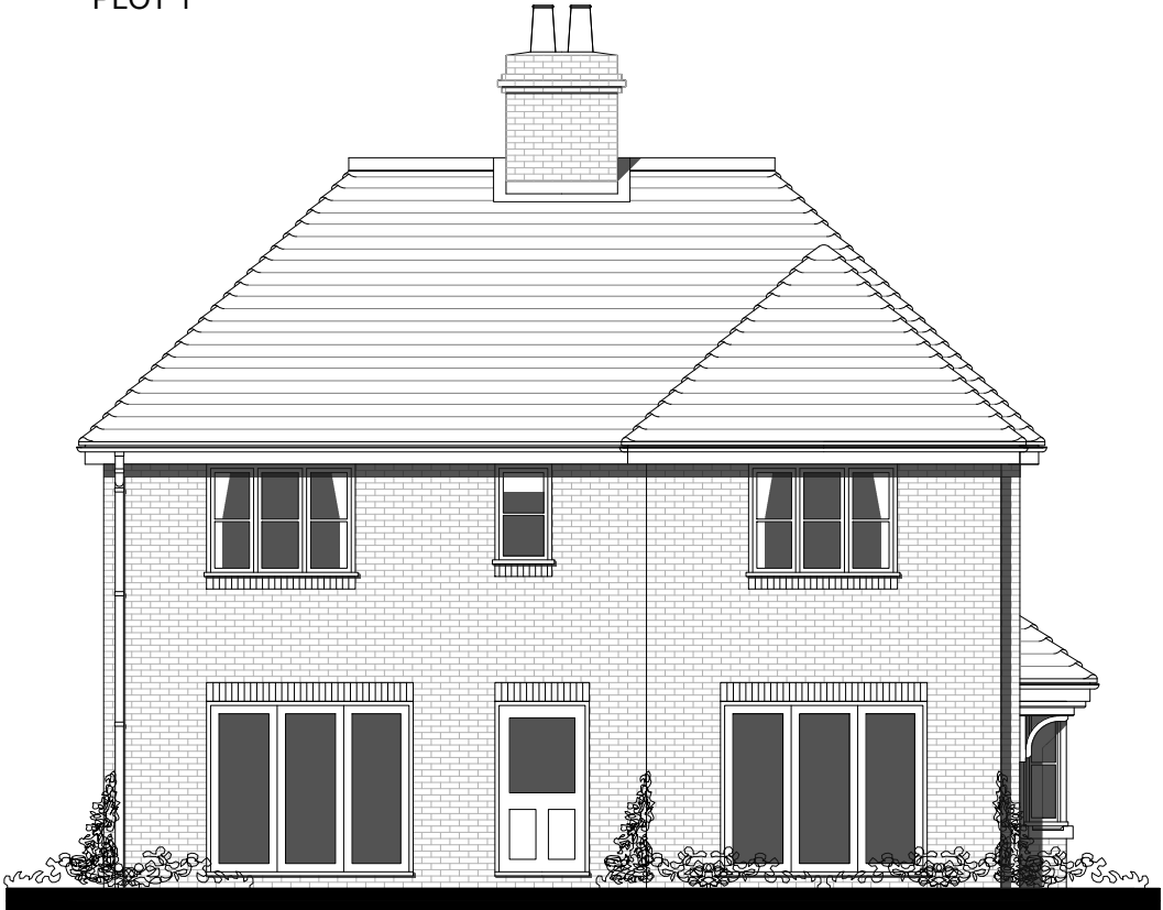
REAR ELEVATION PLOT 1