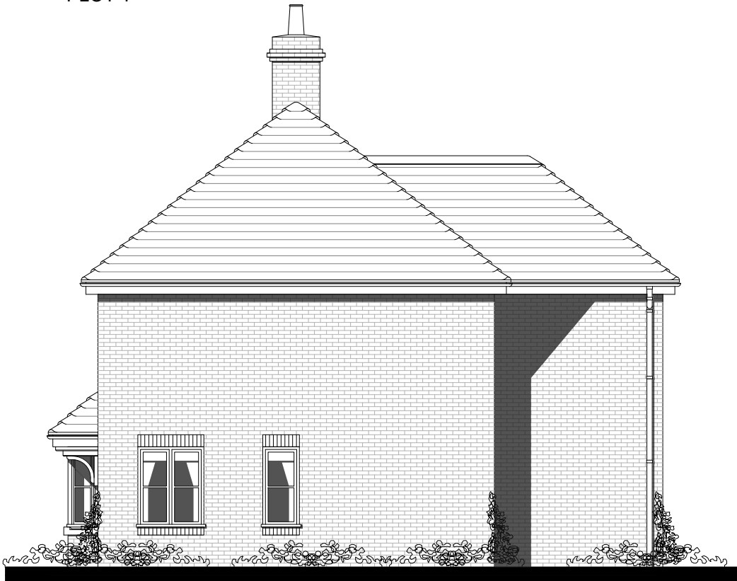
SIDE ELEVATION PLOT 1