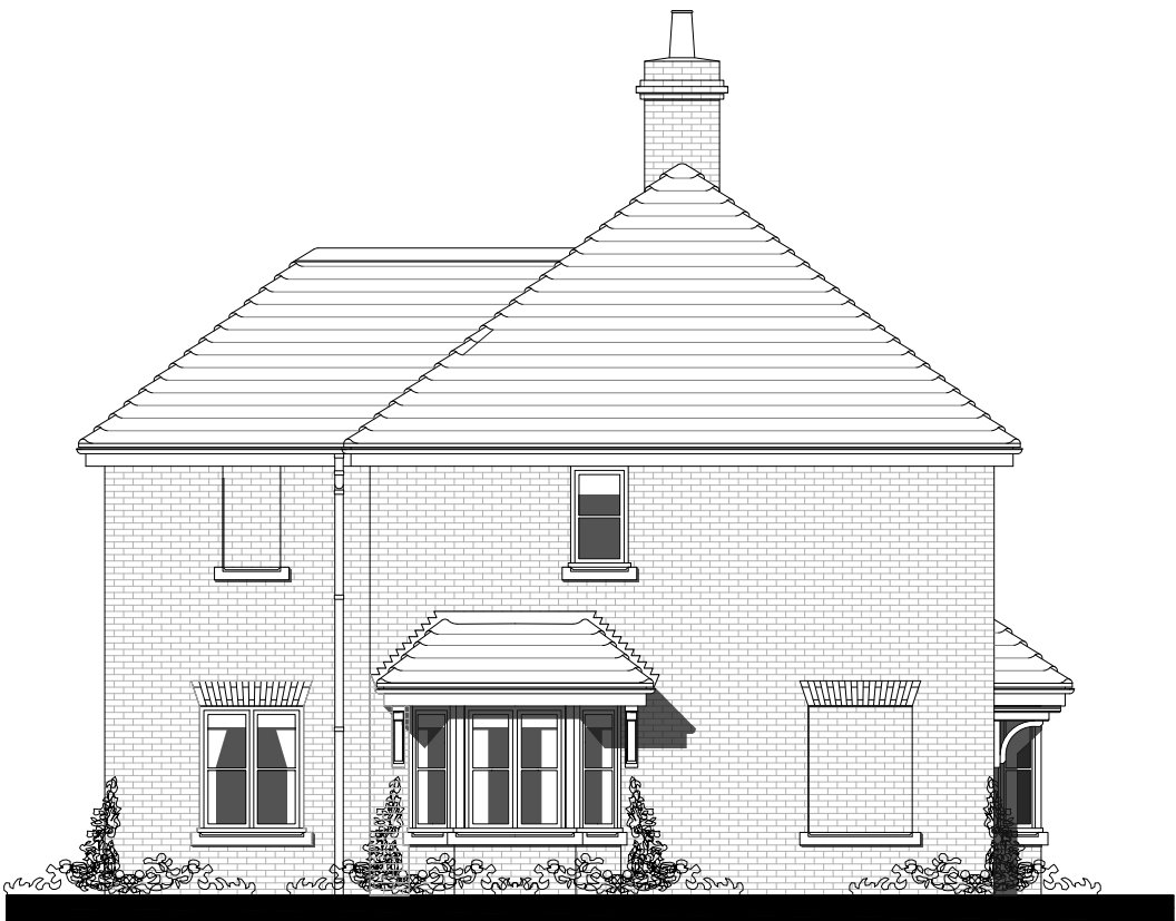
SIDE ELEVATION PLOT 1