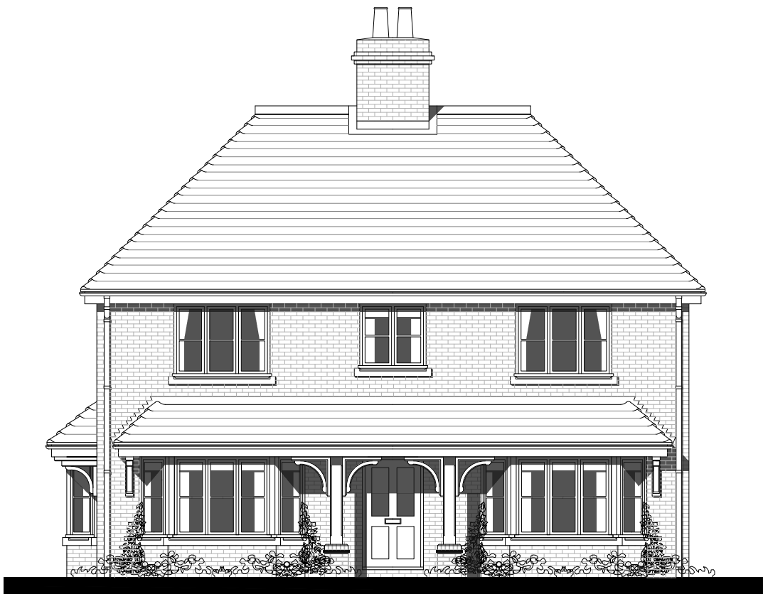
FRONT ELEVATION PLOT 1