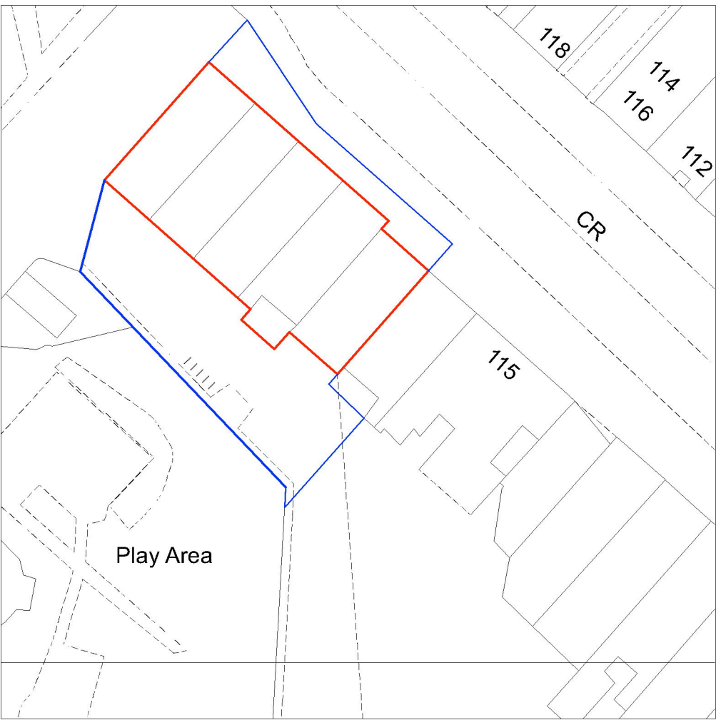
Block Plan @1:500