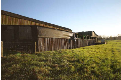
Image 10 - view of adjoining barns to the north