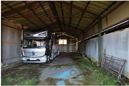
Image 7 - interior of existing barn