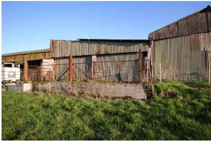
Image 9 - view from west towards existing barns