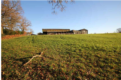
Image 11 - view of site from public footpath