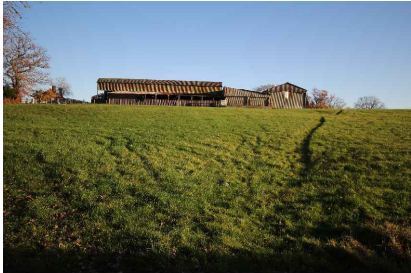
Image 12 - view of site from public footpath