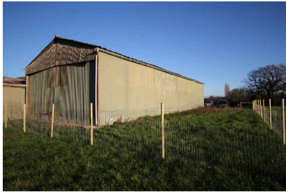
Image 8 - view towards barns