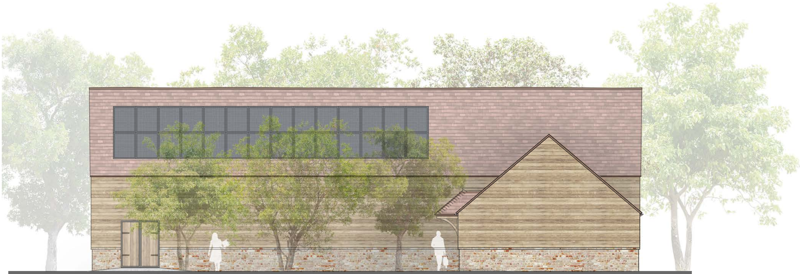
estate barn - front elevation south

handmade plain clay/concrete roof tiles with integrated solar pv panels exposed rafter feet & black aluminium rainwater goods face brickwork plinth with horizontal timber boarding above pale grey aluminium windows + oak doors