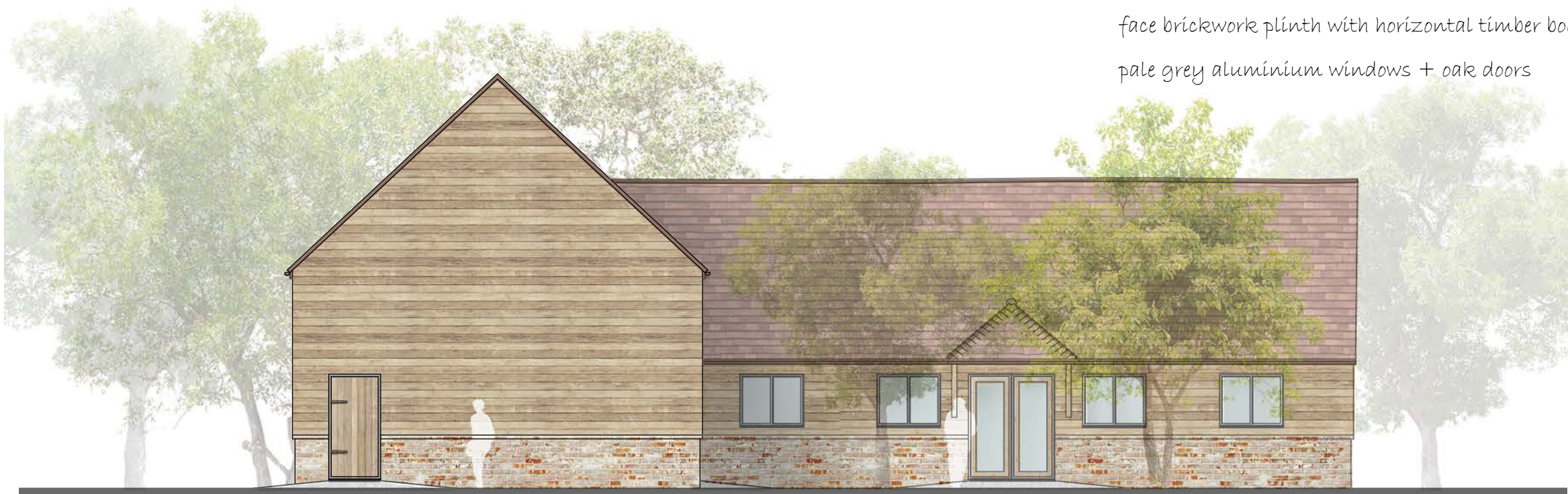
side elevation west

handmade plain clay/concrete roof tiles with integrated solar pv panels exposed rafter feet & black aluminium rainwater goods face brickwork plinth with horizontal timber boarding above pale grey aluminium windows + oak doors