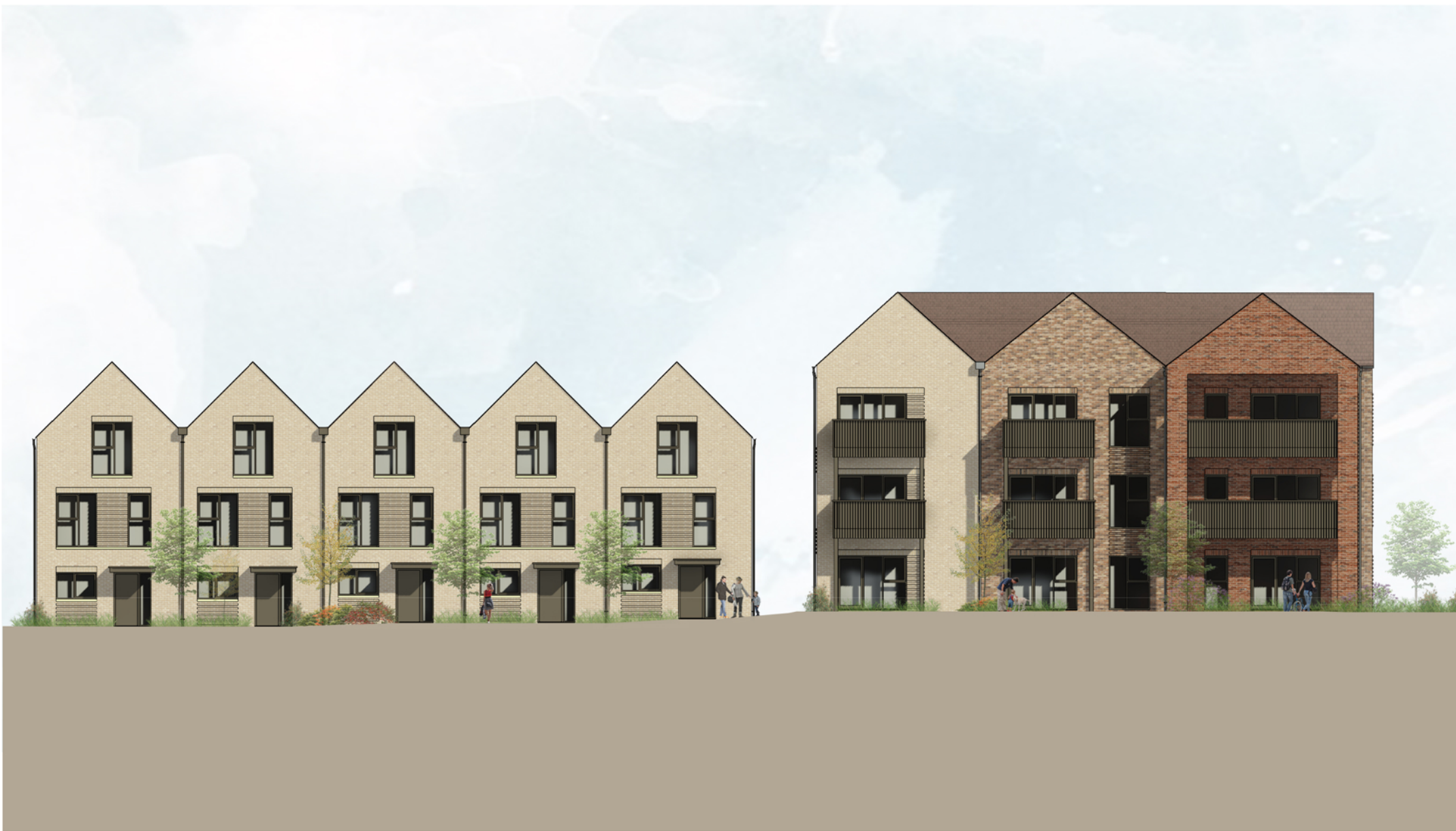
Street Elevation J