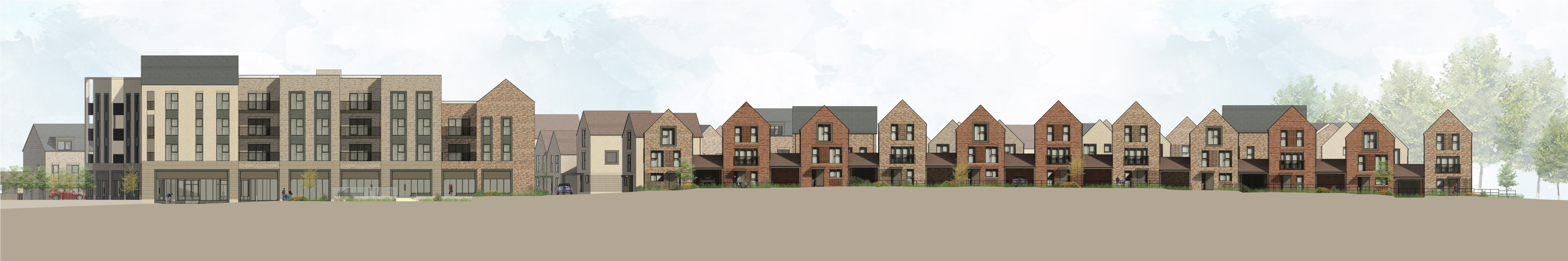
Street Elevation K

Notes Do not scale from this drawing. All contractors must visit the site and be responsible for taking and checking dimensions. All construction information should be taken from figured dimensions only. Any discrepancies between drawings, specifications and site conditions must be brought to the attention of the supervising officer. This drawing & the works depicted are the copyright of JTP. This drawing is prepared for the specific project stage in the Drawing Status section below and it is not intended to be used for any other purpose. Whilst all reasonable efforts are used to ensure drawings are accurate, JTP accept no liability for any reliance placed on, or use made of this plan by anyone for purposes other than those stated in the Drawing Status below.