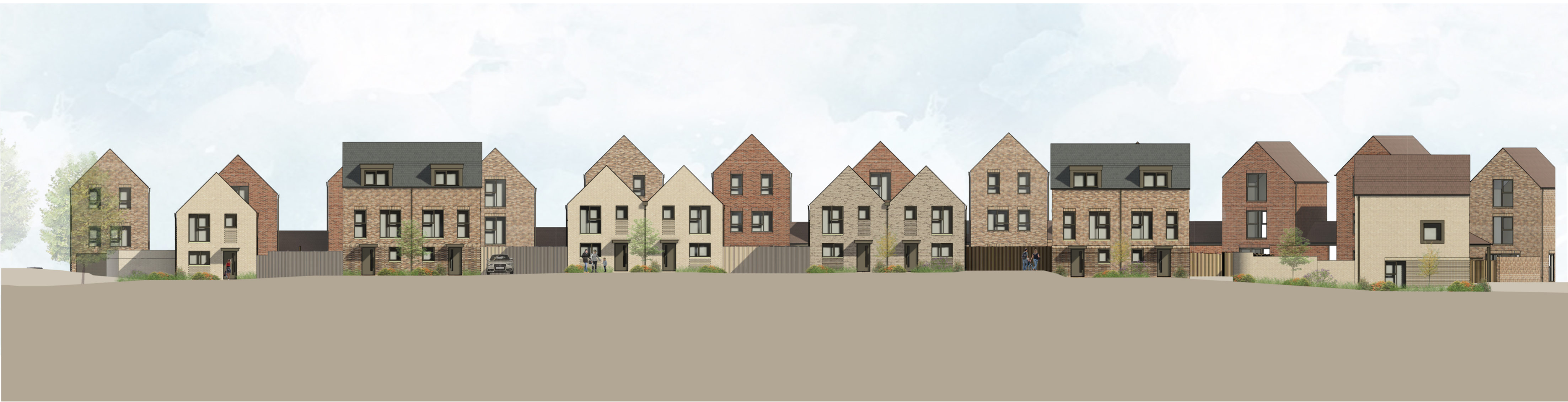
Street Elevation I