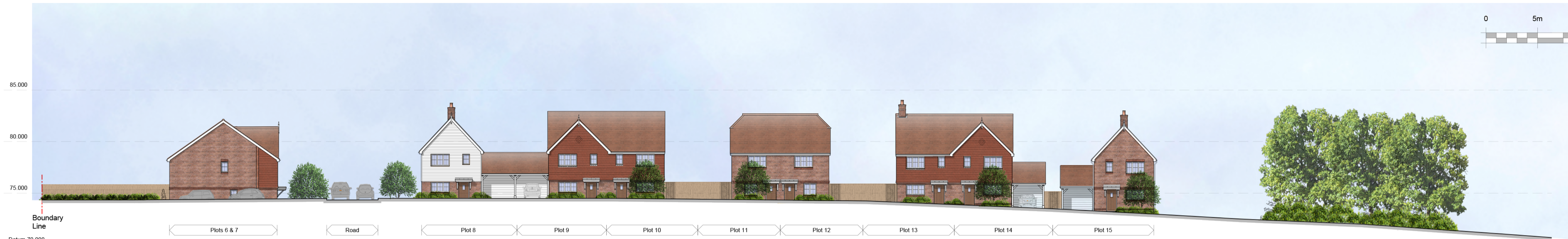
Street Scene A-A