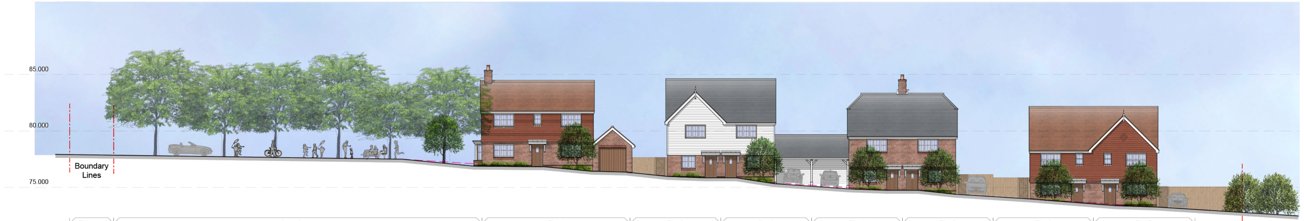
Street Scene D-D