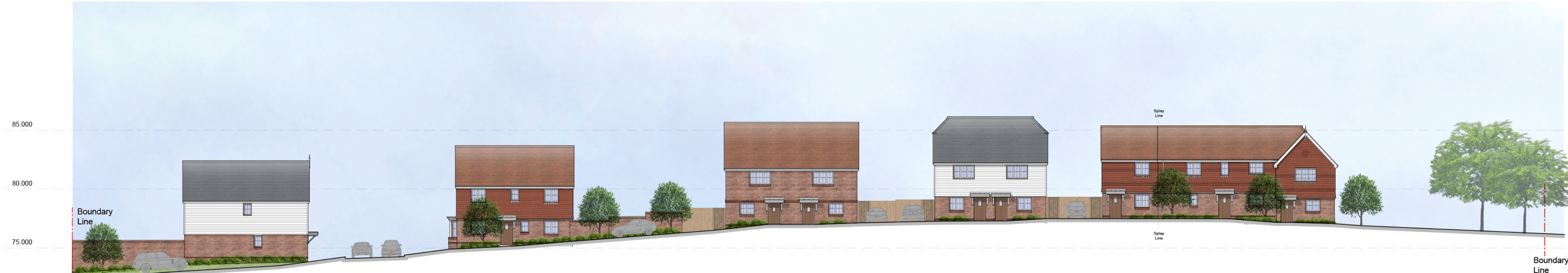
Street Scene C-C