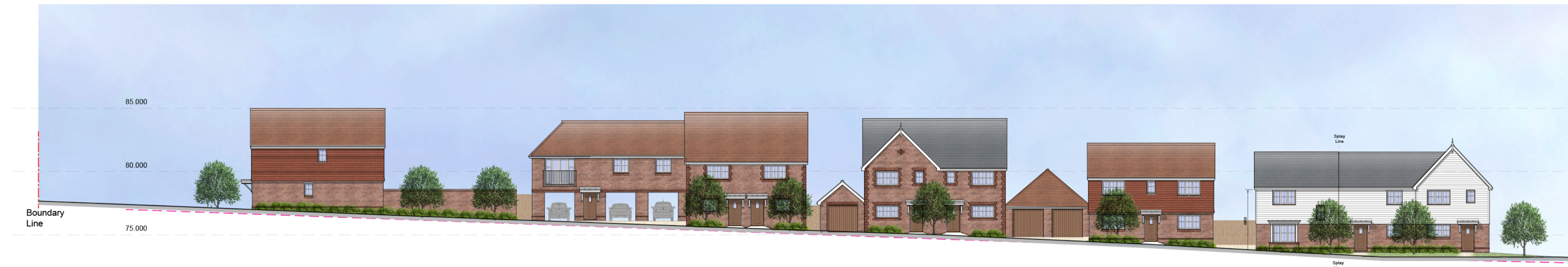
Street Scene B-B