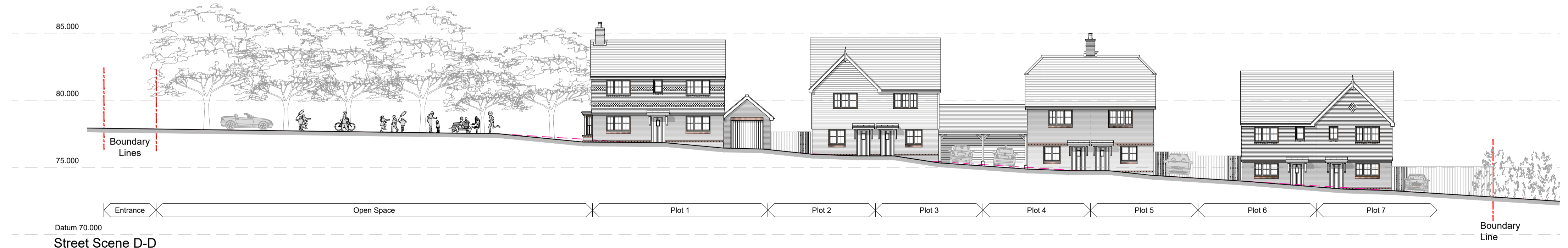
Street Scene D-D