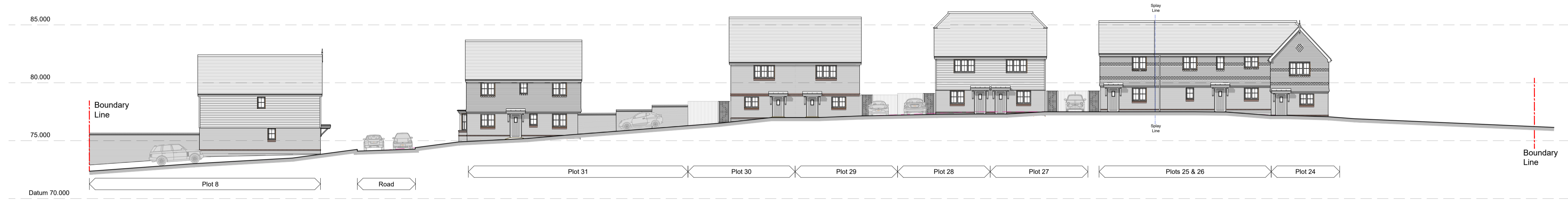
Street Scene C-C