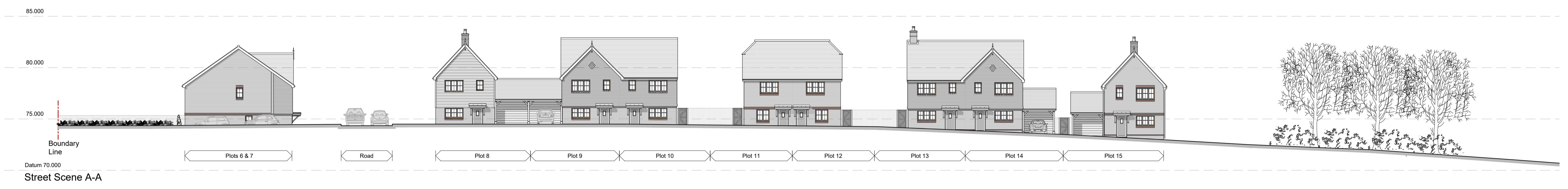
Street Scene A-A