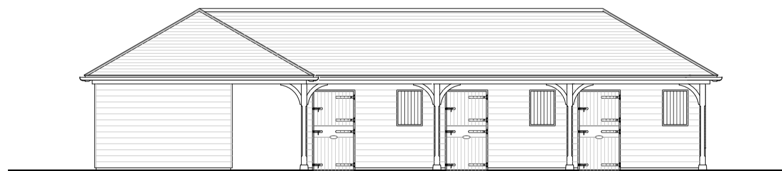
South Elevation 1:100