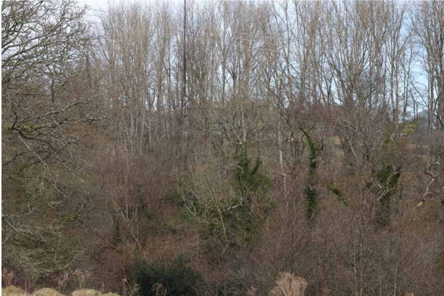
2.7 Viewpoint 7

2.7.1 Location: PRow 29 WH (in the High Weald National Landscape), 550m south west of the Site. GPS ref: Lat 51.05113 N, Long 0.08001W.