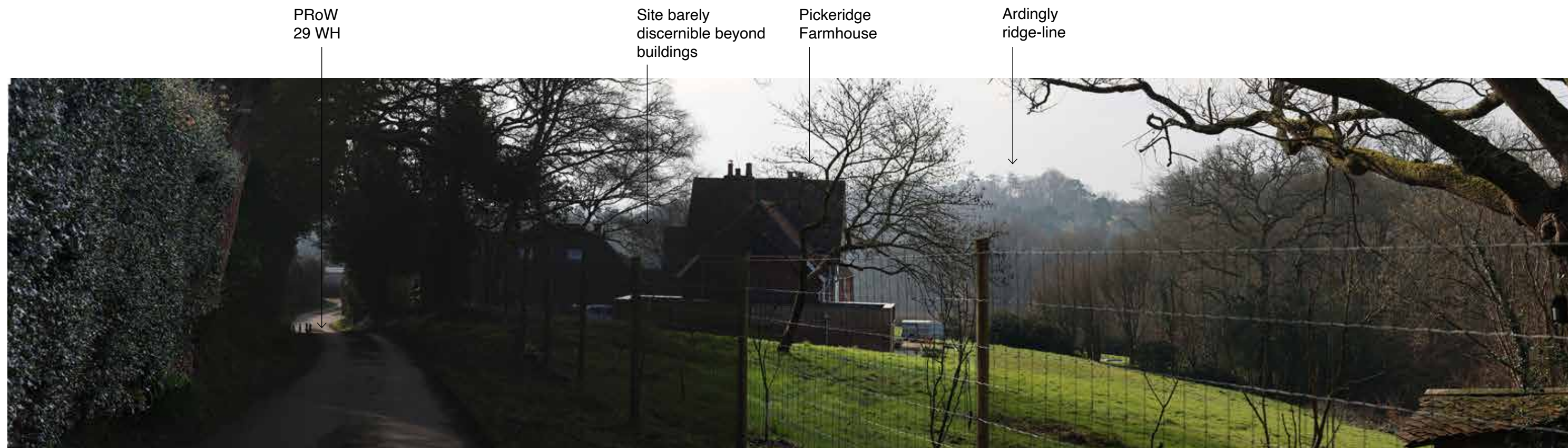
2.1 Viewpoint 1