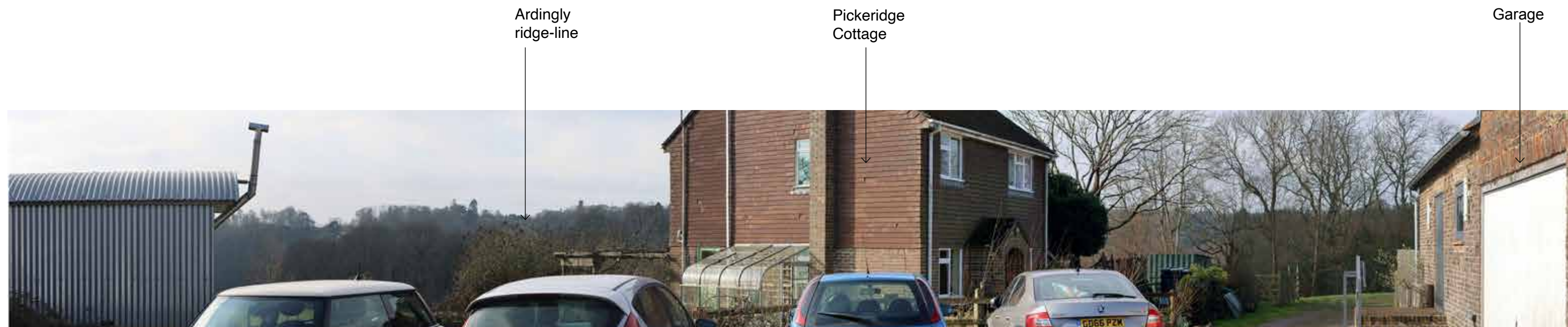
2.2 Viewpoint 2