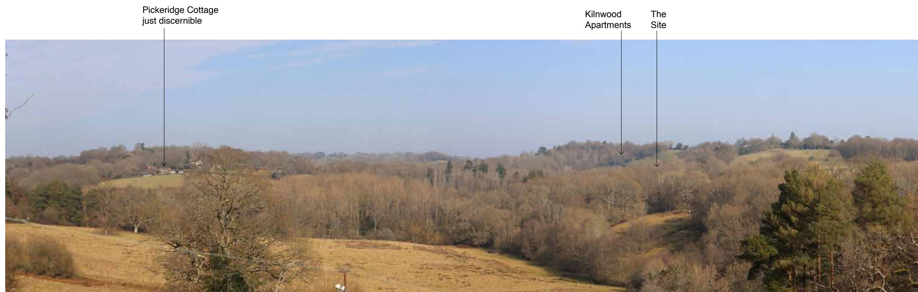
2.11 Viewpoint 11