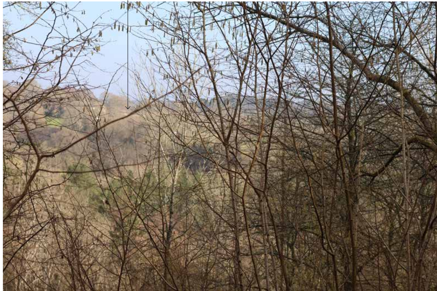
2.10 Viewpoint 10