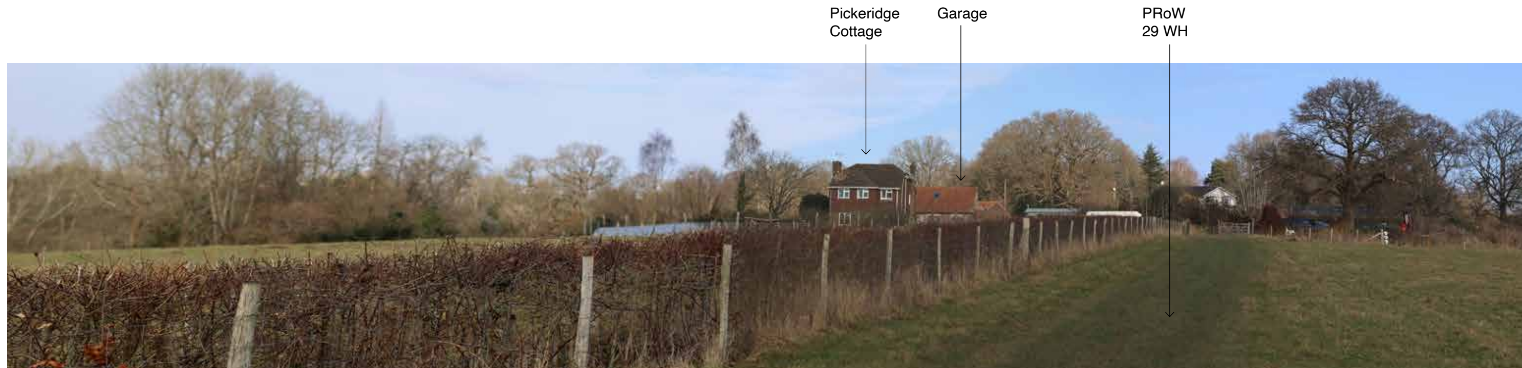
2.4 Viewpoint 4