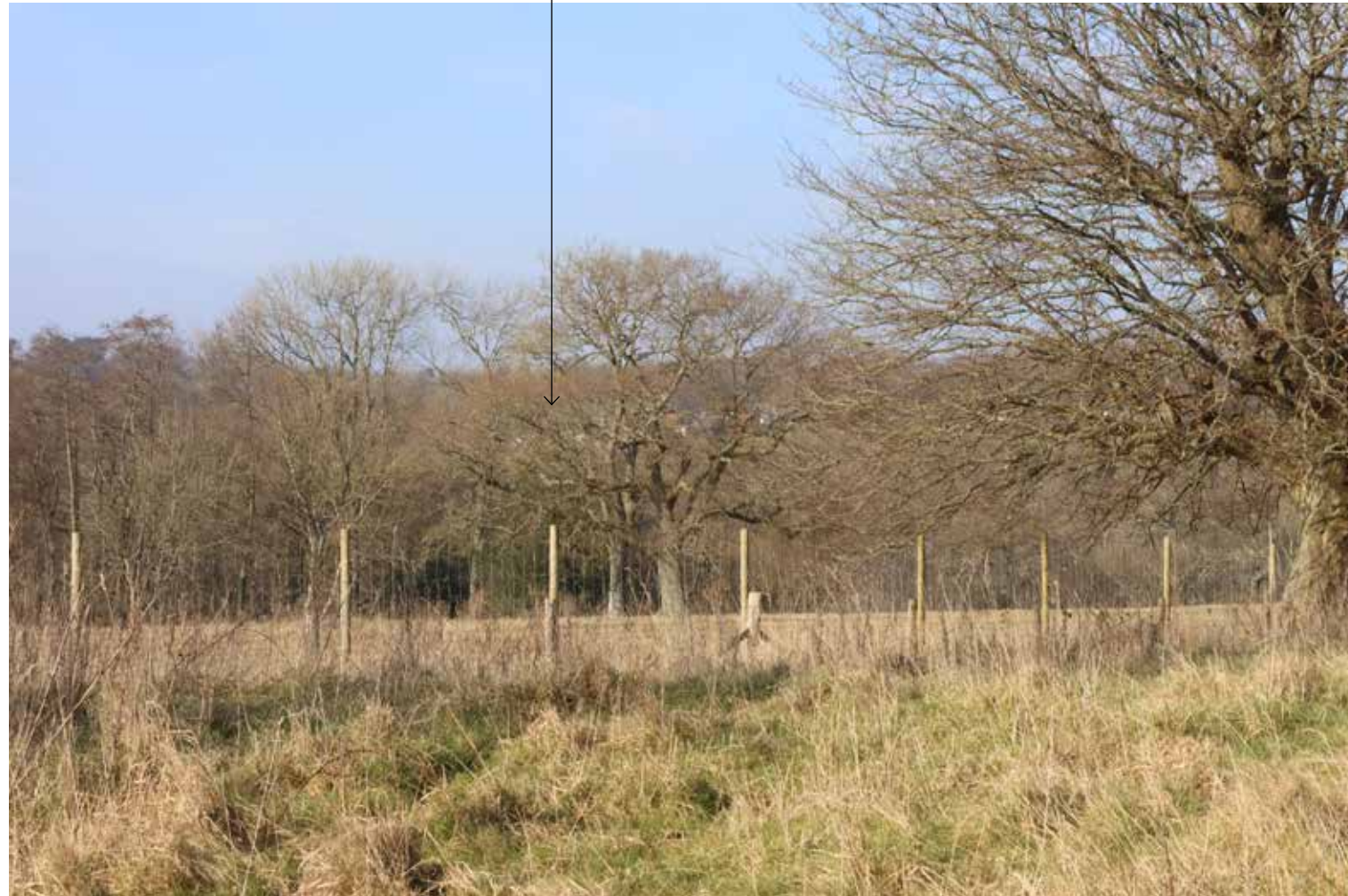
2.12 Viewpoint 12

2.12.1 Location: PRoW 31 WH (in the High Weald National Landscape), 850m south east of the Site.