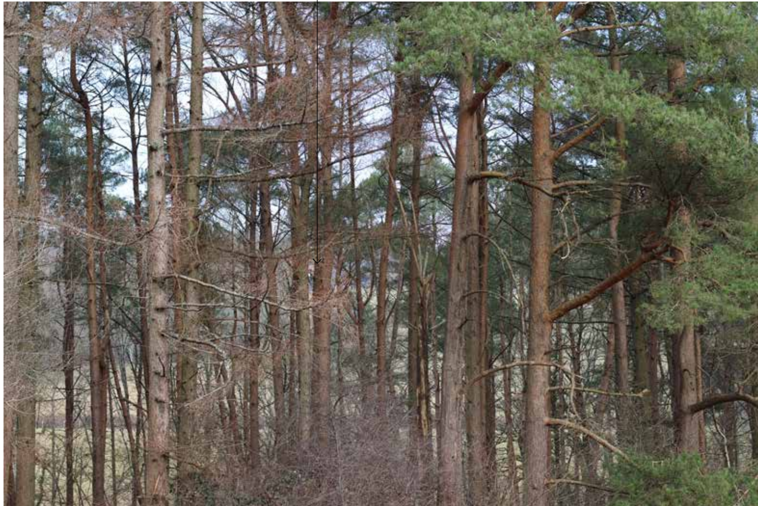
2.8 Viewpoint 8