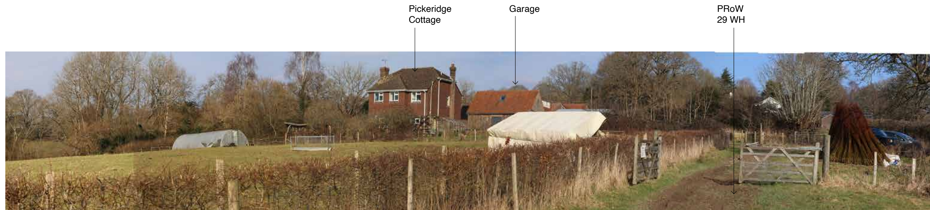
2.3 Viewpoint 3