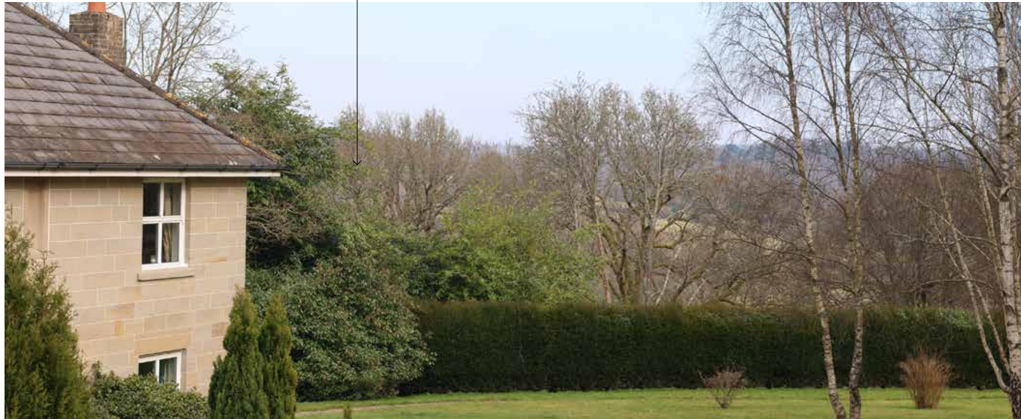
2.9 Viewpoint 9