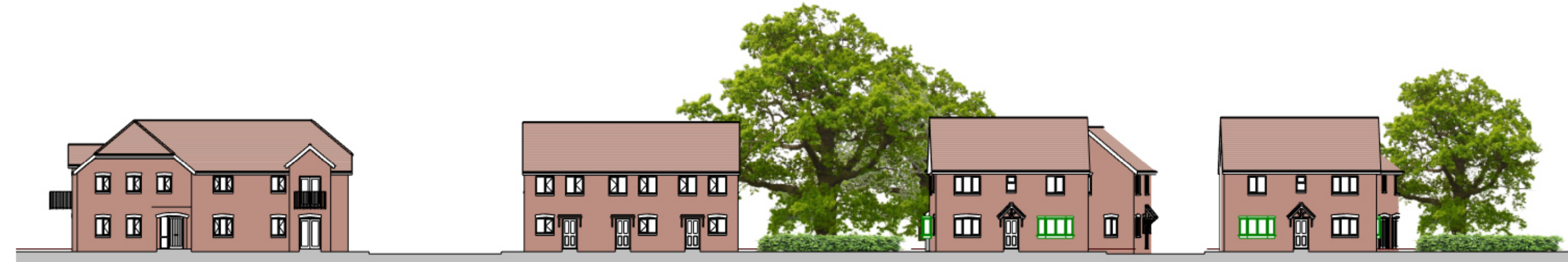
14 Street Scene 14 1 : 200