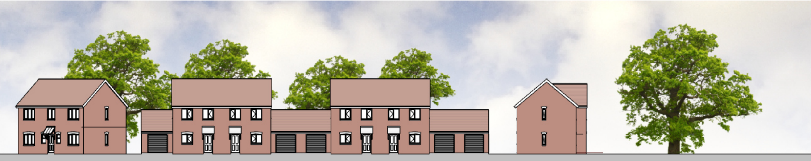
8 Street Scene 08 1 : 200