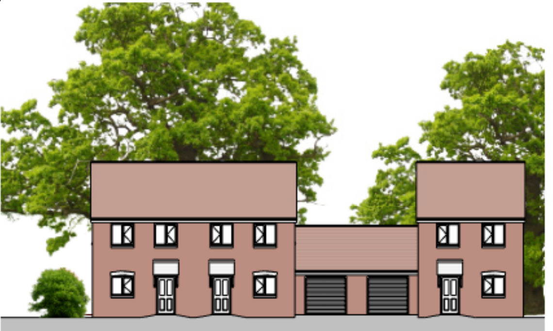
11 Street Scene 11 1 : 200