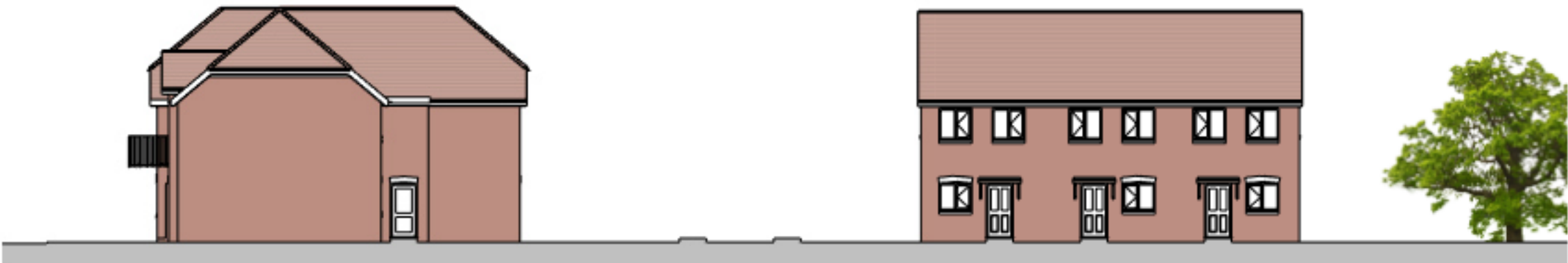
12 Street Scene 12 1 : 200