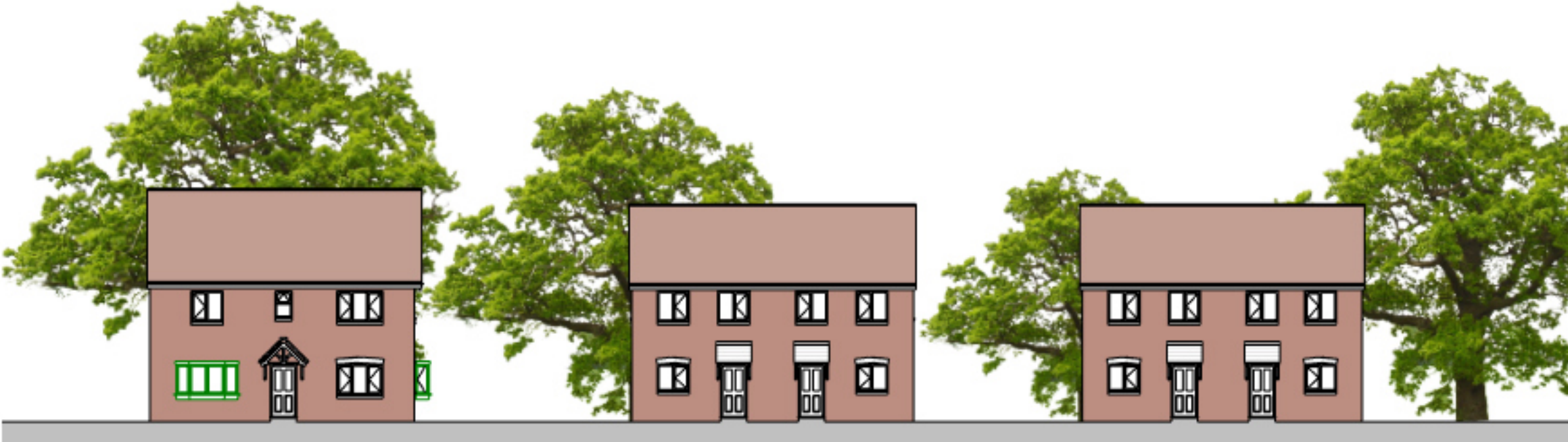
16 Street Scene 16 1 : 200