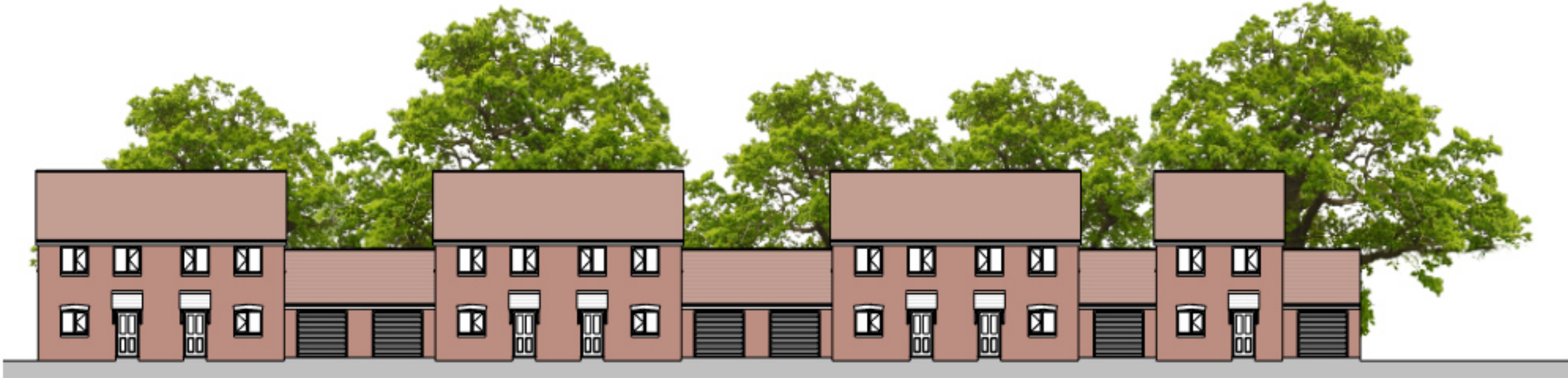
9 Street Scene 09 1 : 200