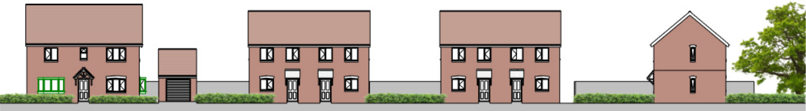
15 Street Scene 15 1 : 200