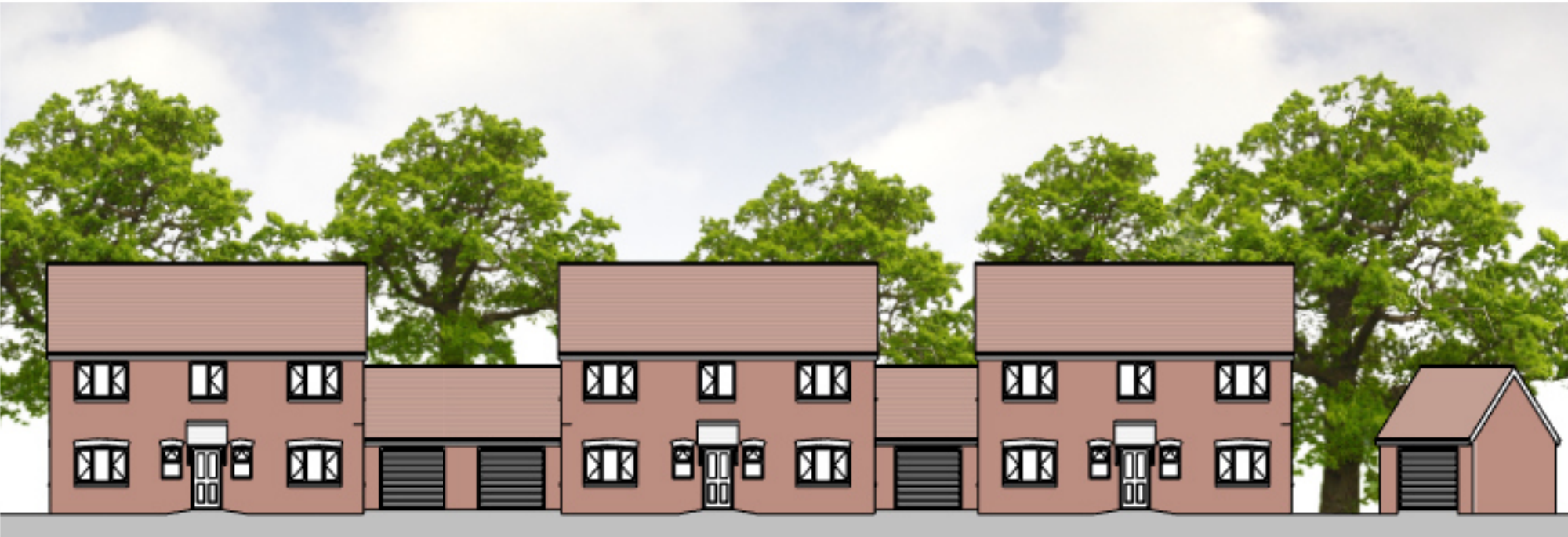
10 Street Scene 10 1 : 200