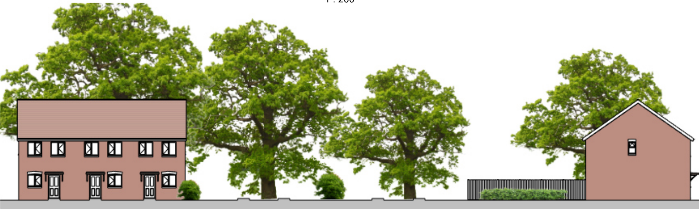
13 Street Scene 13 1 : 200