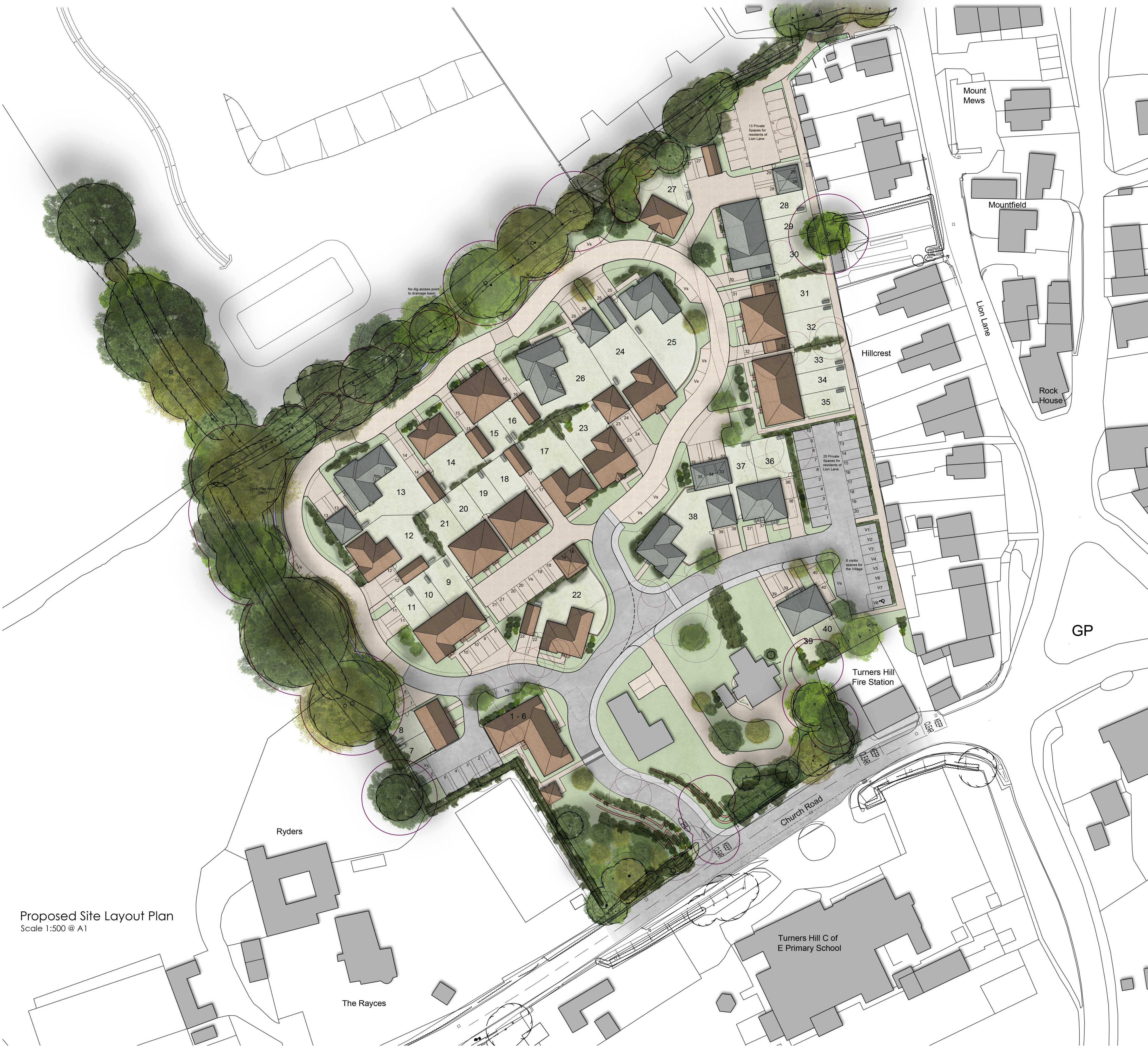
Proposed Site Layout Plan Scale 1:500 @ A1

This drawing and the design are the copyright of ON Architecture Ltd only. This drawing should not be copied or reproduced without written consent. All dimensions are to be checked on site prior to setting out and fabrication and ON Architecture Ltd should be notified of any discrepancy prior to proceeding further. For Construction & Fabrication Purposes - Do not scale from this drawing, use only the illustrated dimensions herein. Additional dimensions are to be requested and checked directly. Illustrated information from 3rd party consultants/specialists is shown as indicatively only. See other consultant / specialist drawings for full information and detail. All aspects of the architectural design concerning fire performance / fire safety (whether or not illustrated / annotated) are to be considered as 'For Approval only, irrespective of the drawing status / suitability.'