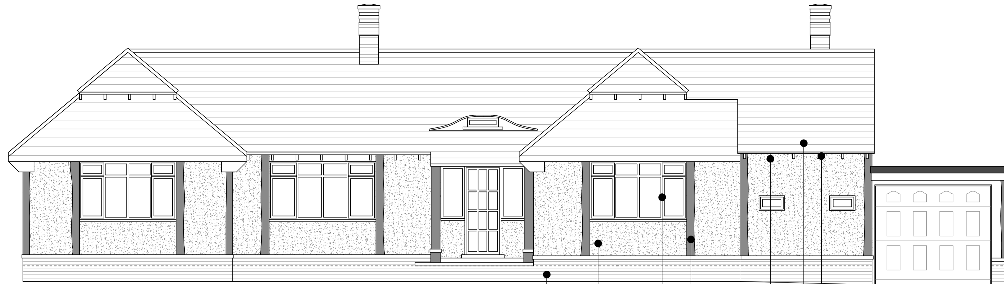
EXISTING FRONT ELEVATION SCALE 1/50 ON A3