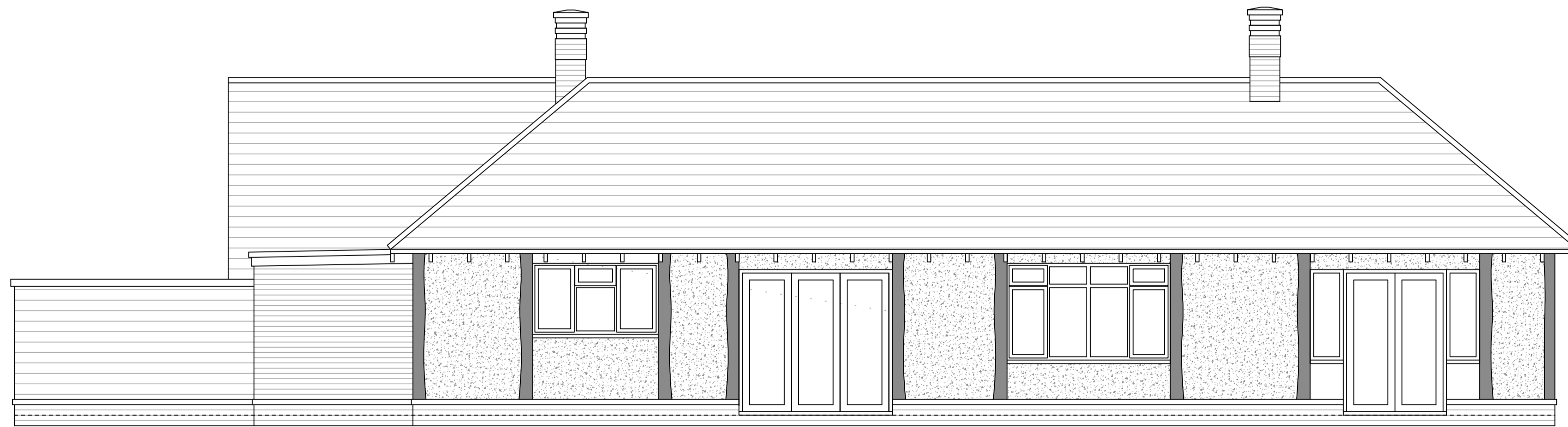
EXISTING REAR ELEVATION SCALE 1/50 ON A3