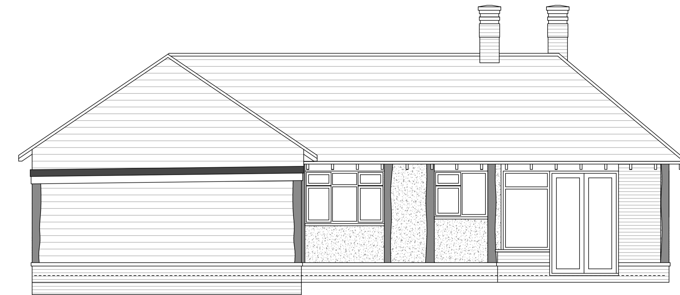
EXISTING SIDE ELEVATION SCALE 1/50 ON A3