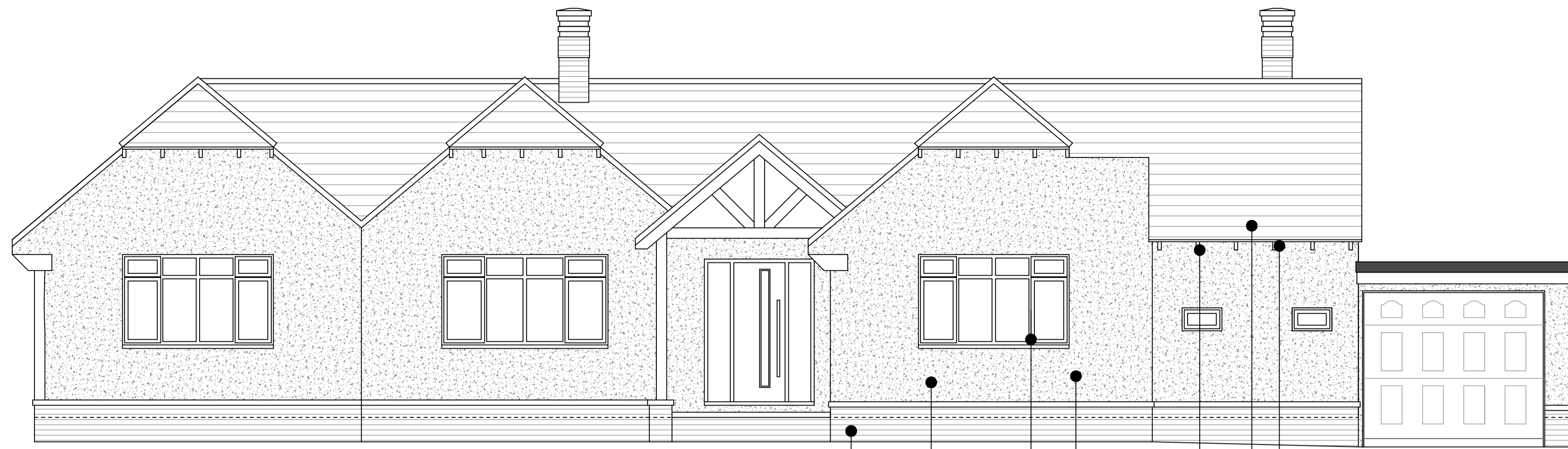
PROPOSED FRONT ELEVATION SCALE 1/50 ON A3