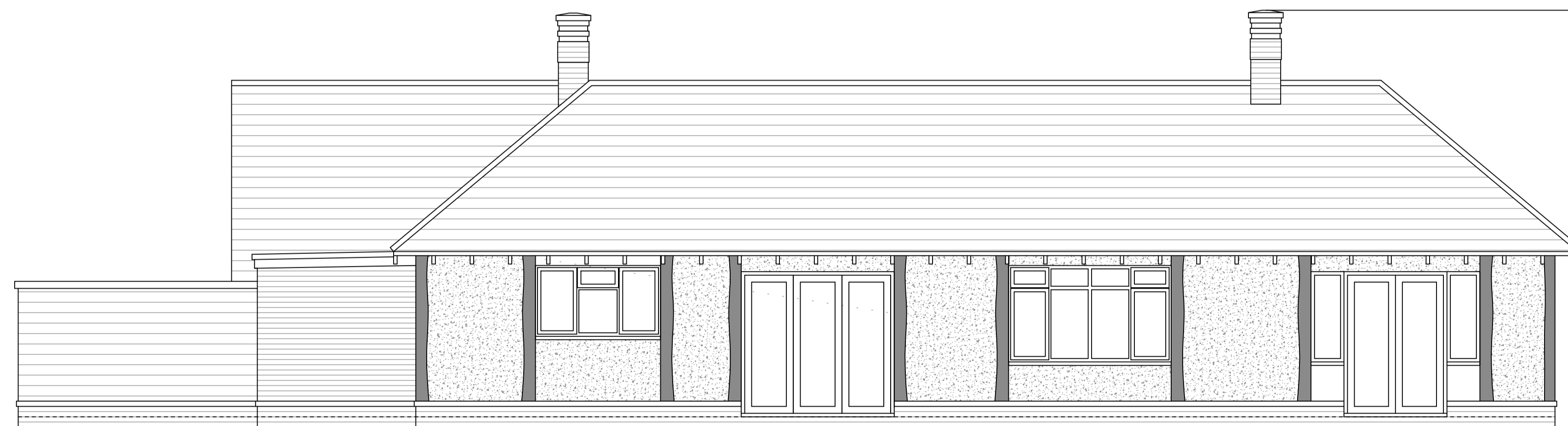
EXISTING REAR ELEVATION SCALE 1/50 ON A3