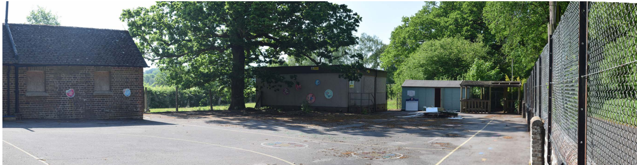
E: View across southern playground towards porta cabin, shed and playing field