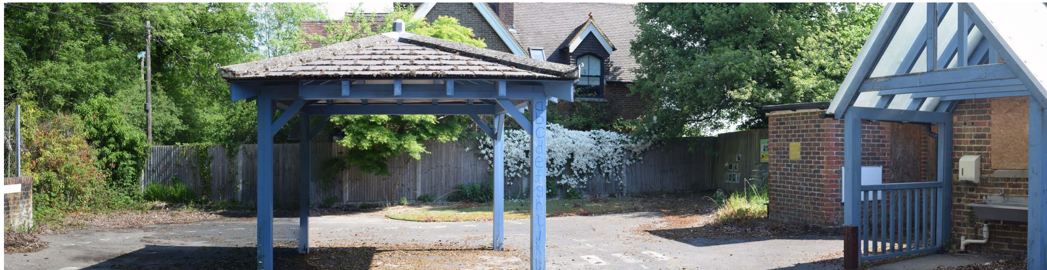
A: Northern playground and boundary to The Old School House