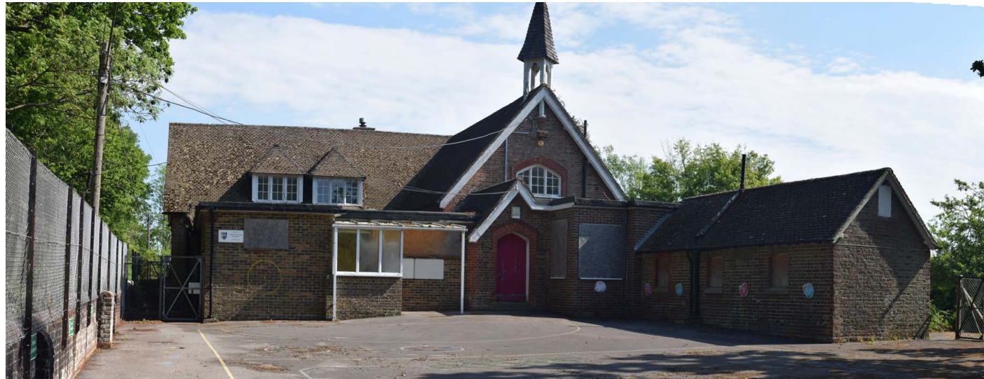
C: School building viewed from southern playground