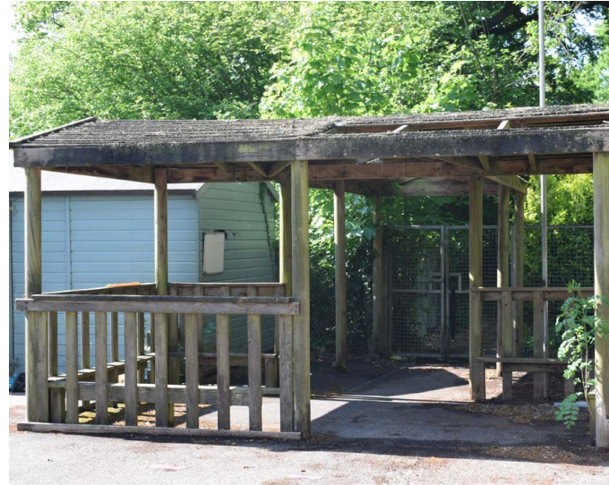
D: Entrance to school from Slaugham Lane