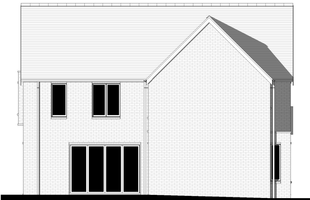
Left Flank Elevation