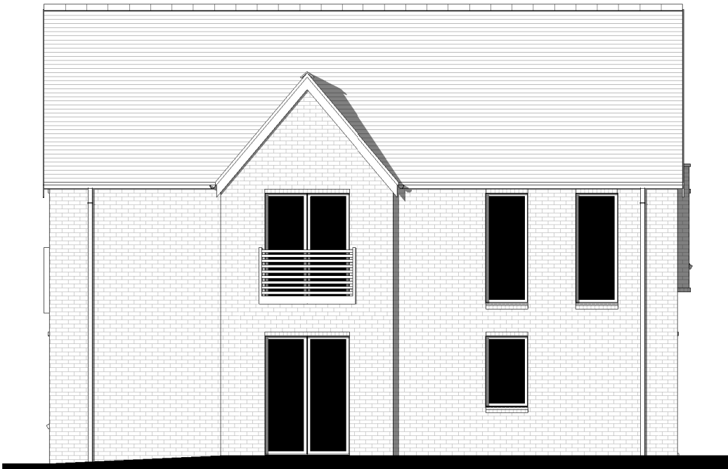
Right Flank Elevation