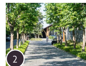
2 Tree-lined route from neighbourhood square