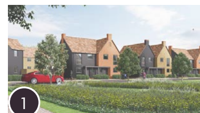
1 Bellway scheme and landscaped Green Spoke