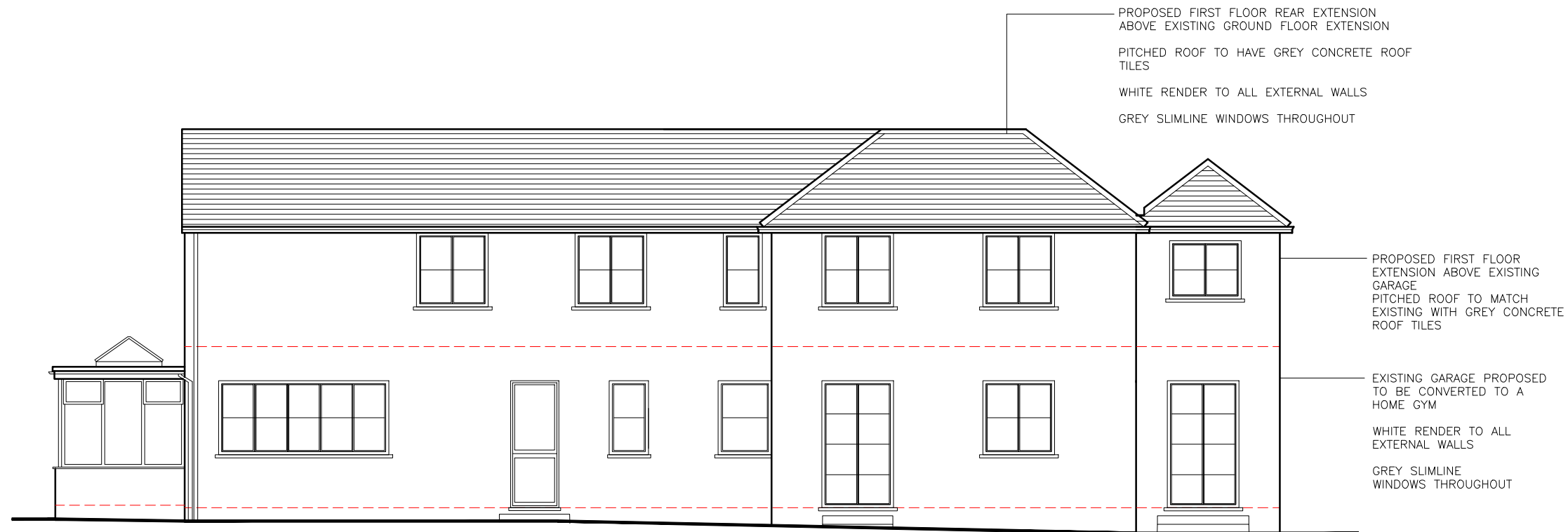
C) Proposed Rear Elevation