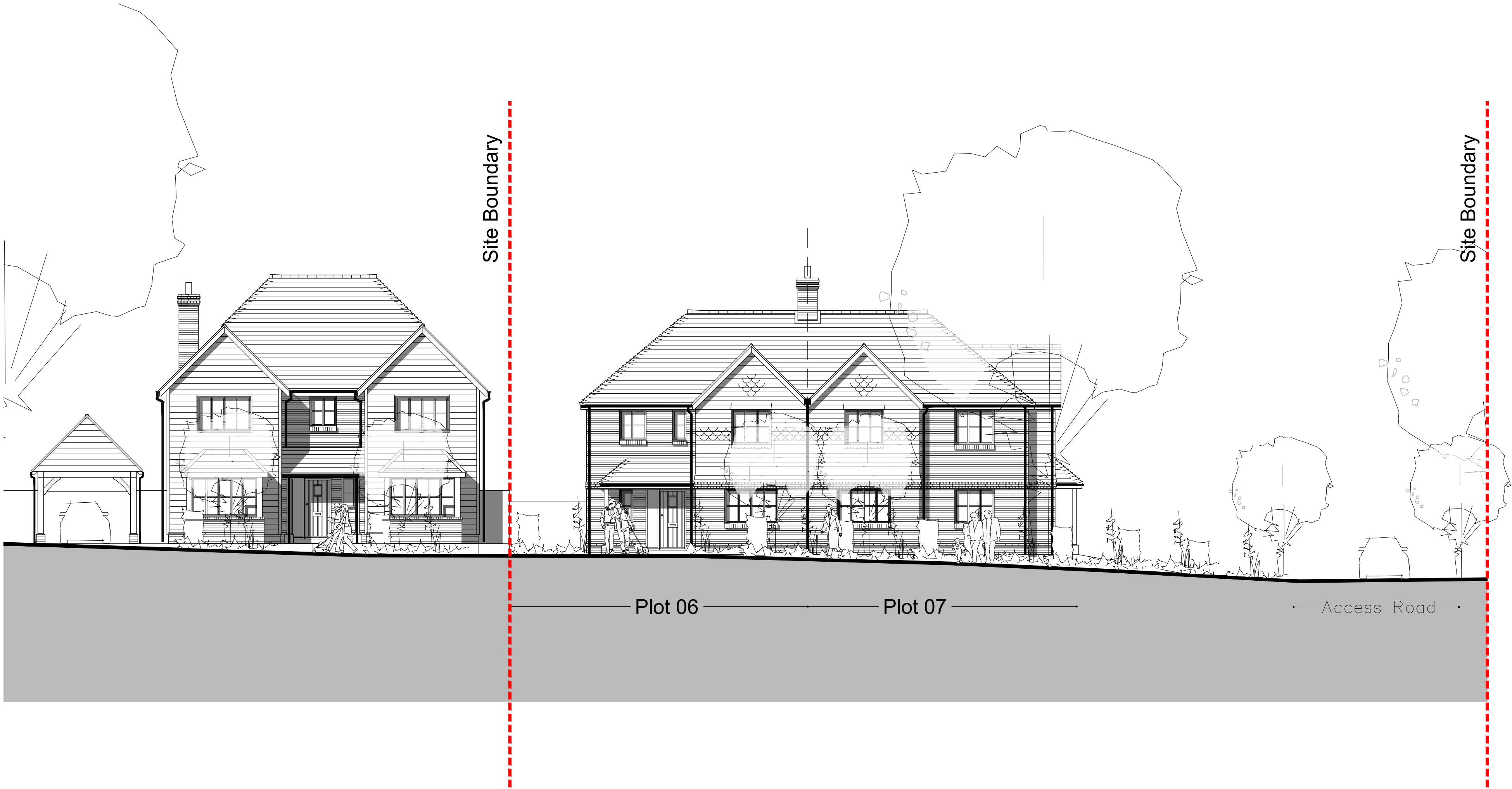
Street Scene A