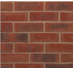
Feature Brick- Ibstock Harrington Red