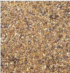
Permeable resin bound gravel - golden Quartz 2-5mm