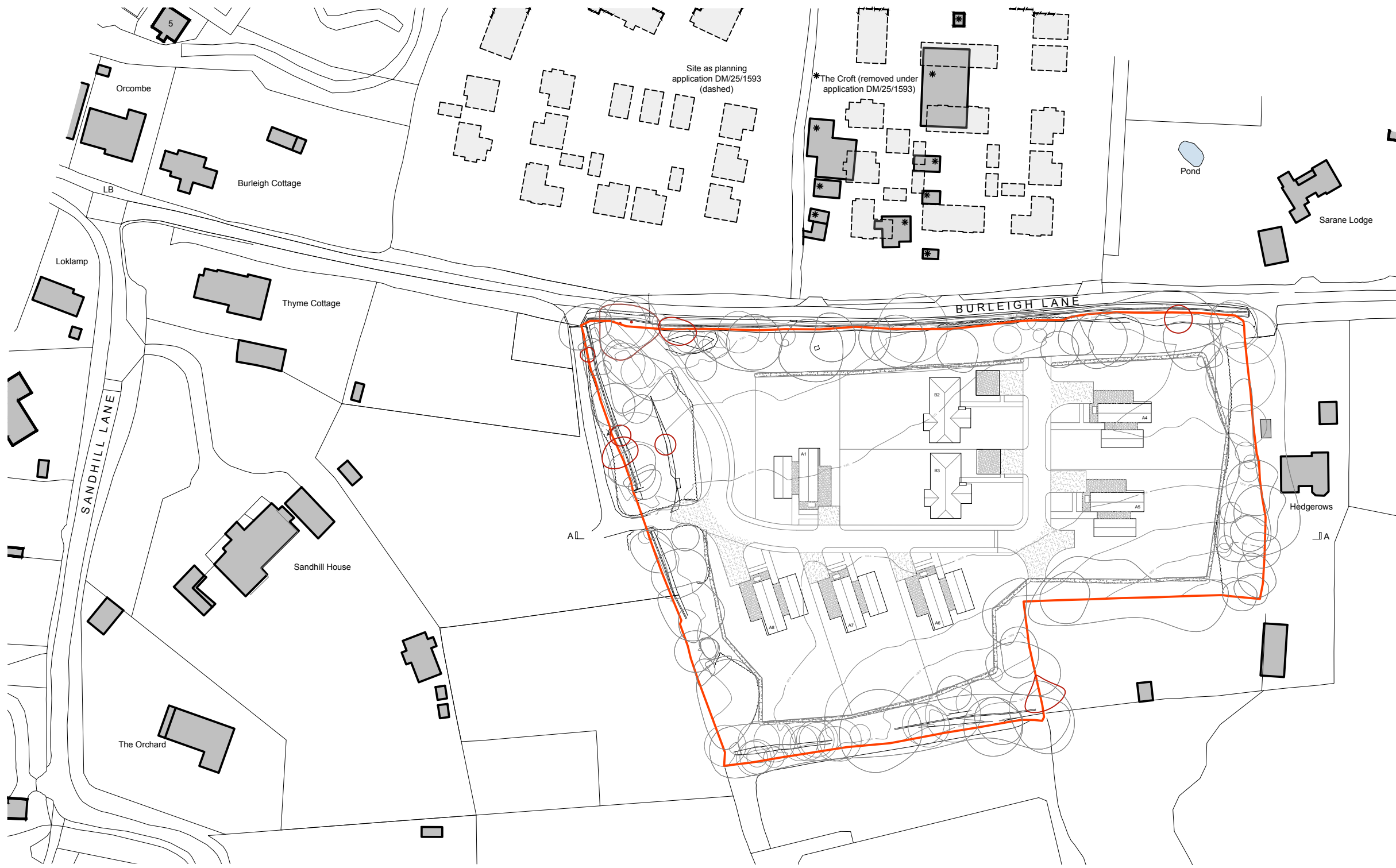
Proposed Location Plan 1:1250