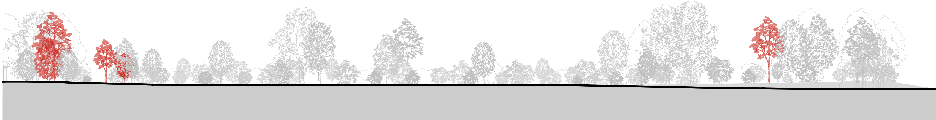
Existing Site Section A-A 1:500