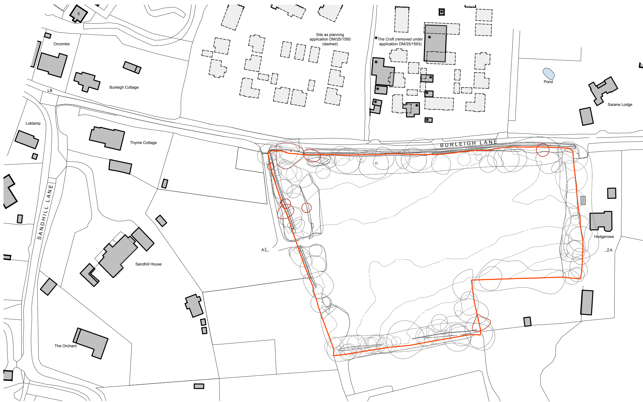
Existing Location Plan 1:1250