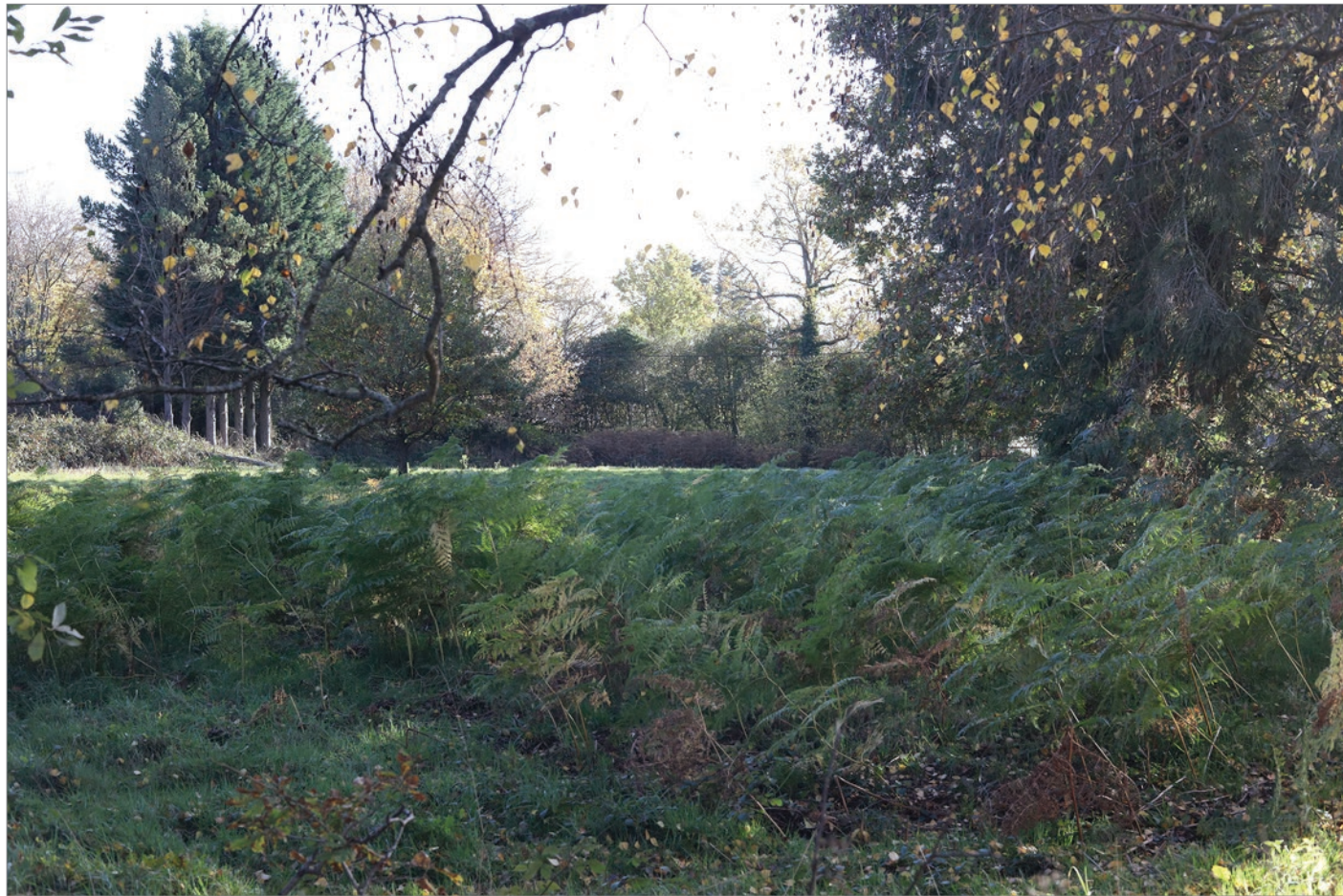
Context photograph D: View from new PROW at Hornbeam Place towards Site.