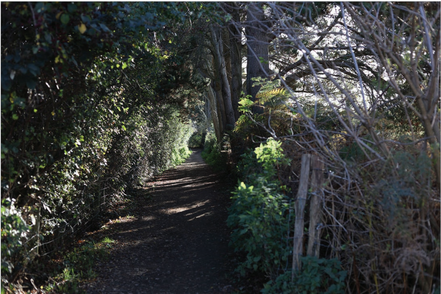
Context photograph F: View from new PROW at Hornbeam Place towards Site.