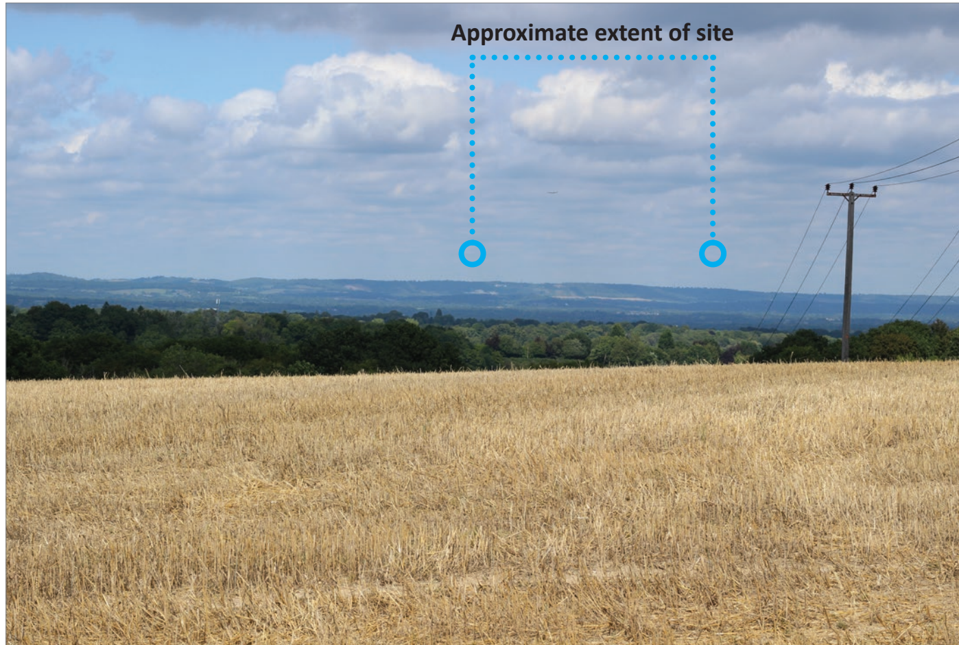
Context photograph K: View from Footpath WEH-13WH at Selsfield Common