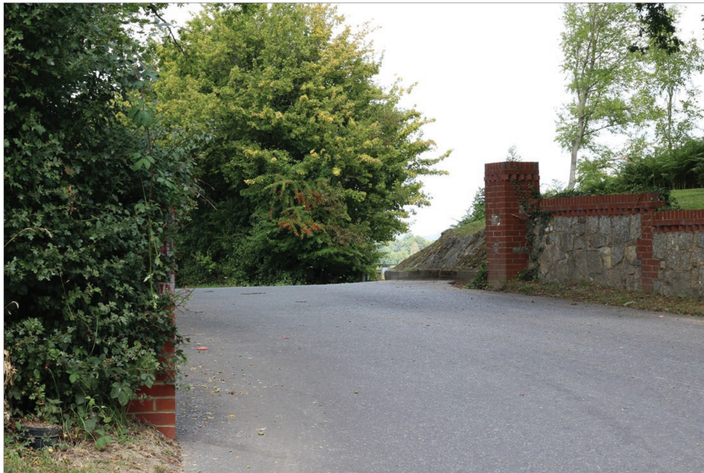
Context photograph I: East Street, east of Turners Hill