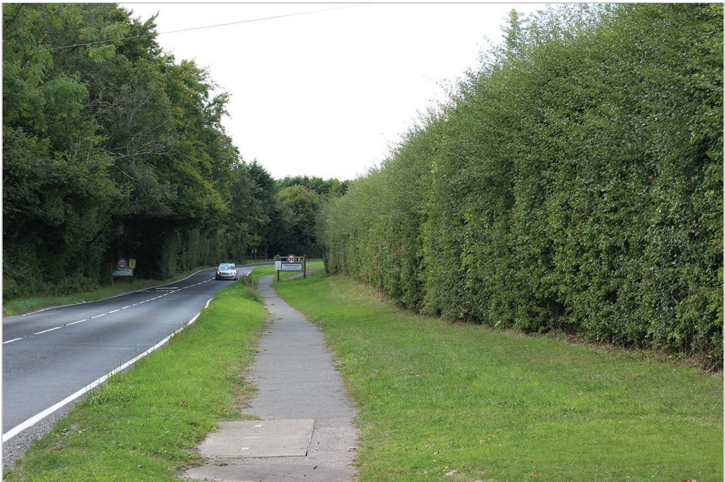
Context photograph J: East Street, east of Turners Hill