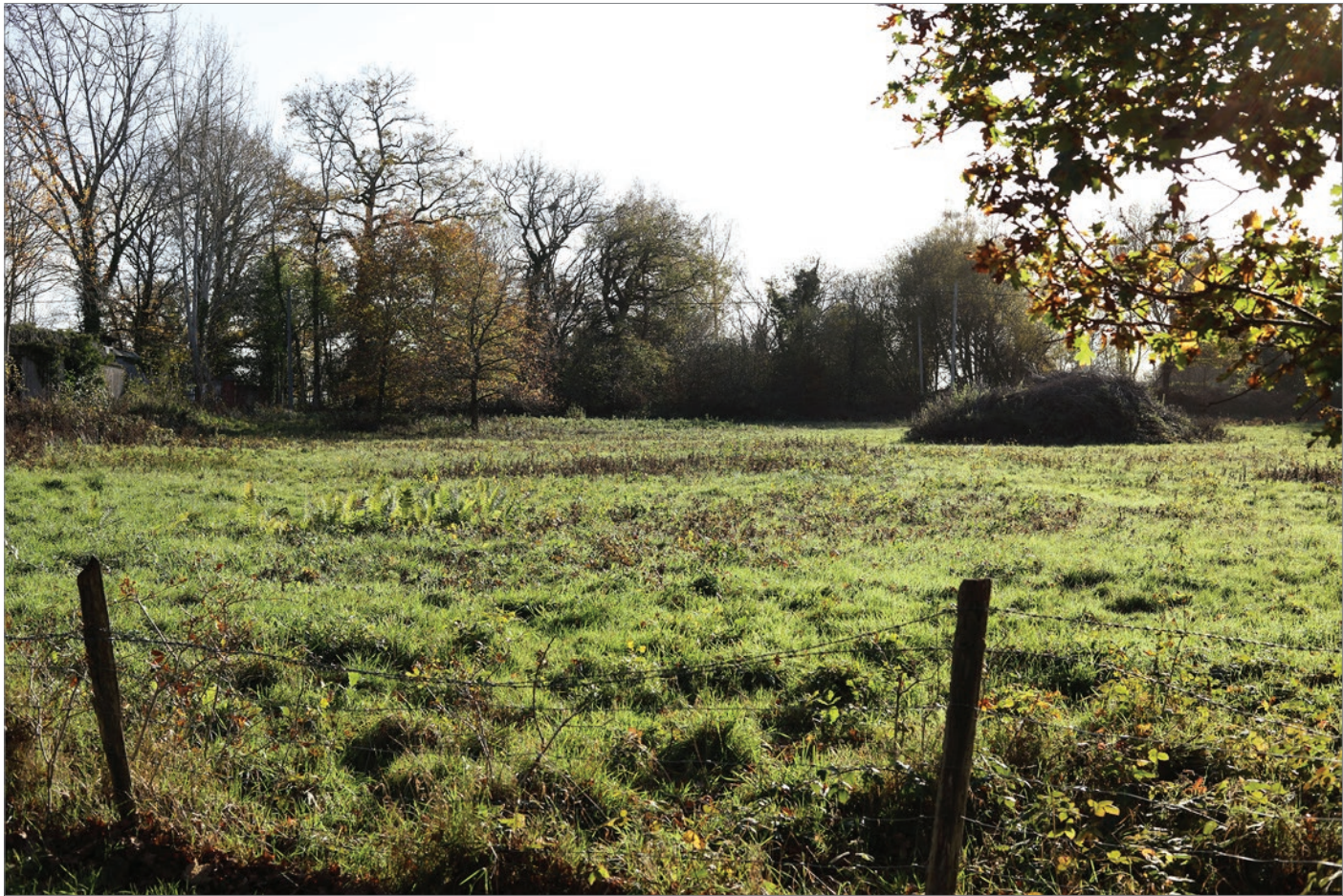
Context photograph B: View from Sycamore Lane towards Site.