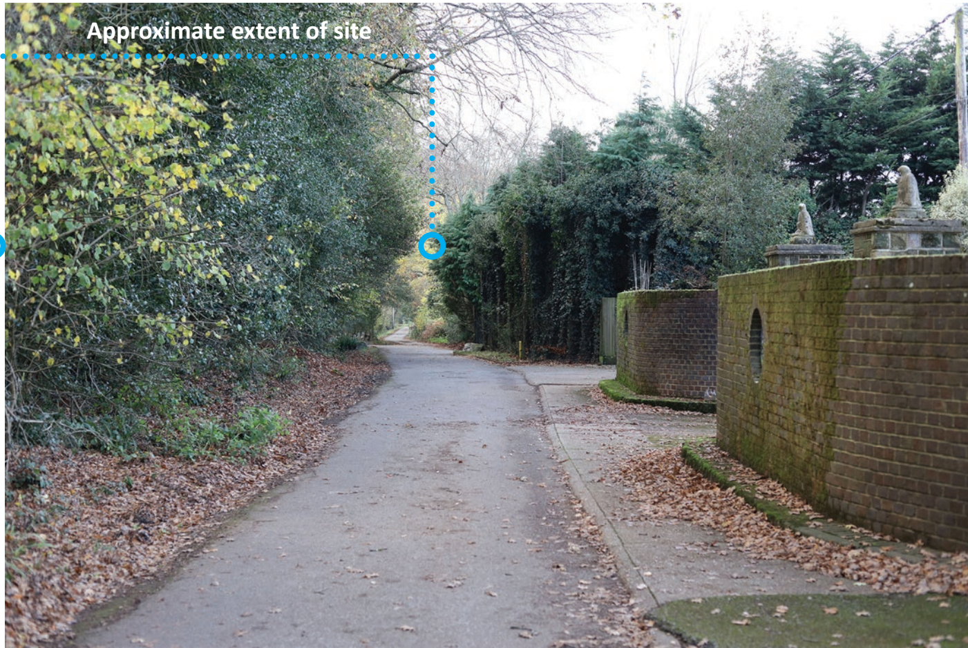
Context photograph G: View from Burleigh Lane (outside Trishlands) looking west towards Site.