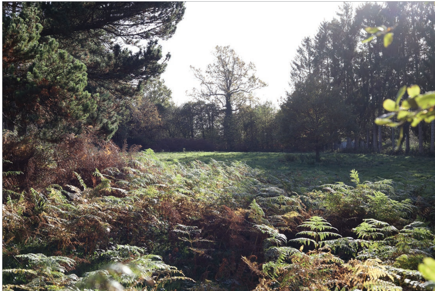
Context photograph E: View from new PROW at Hornbeam Place towards Site.