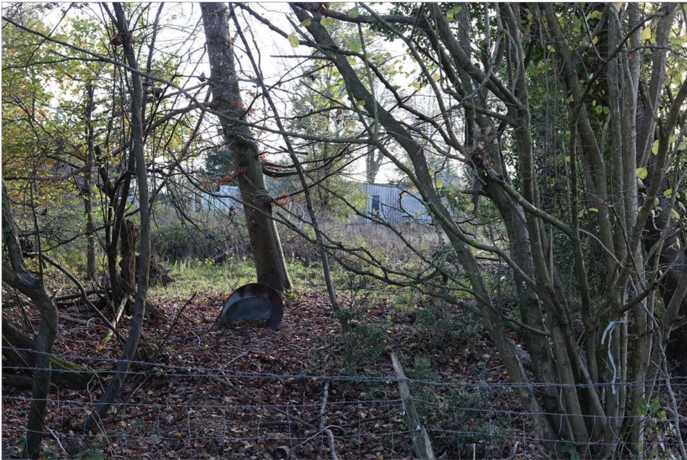
Context photograph C: View from new PROW at Hornbeam Place towards Site.