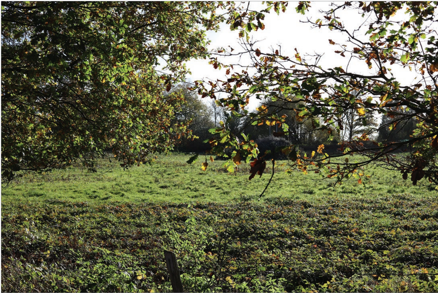
Context photograph A: View from Sycamore Lane towards Site.