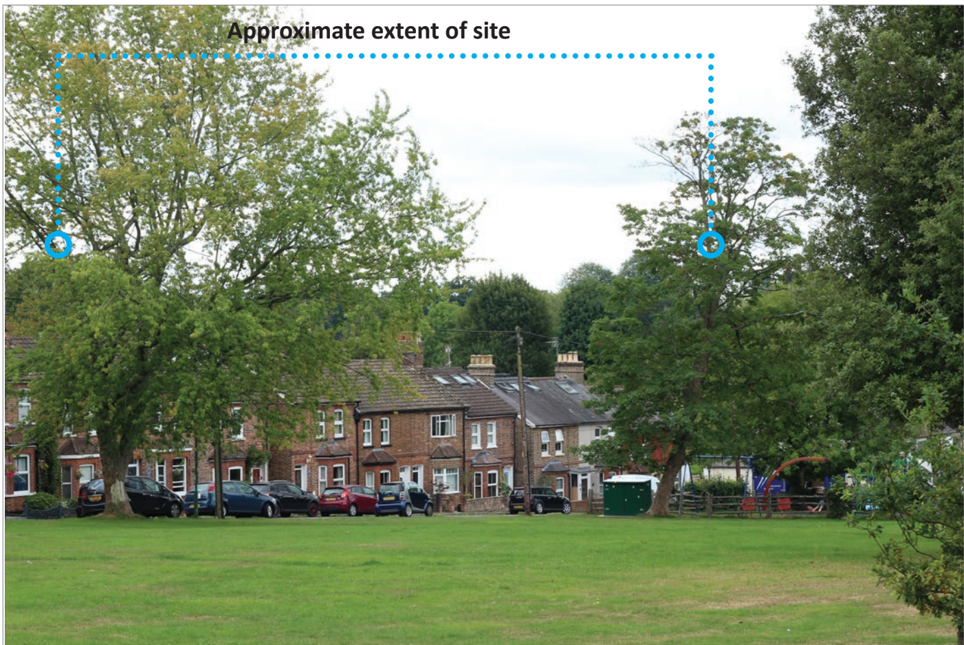
Context photograph H: Crawley Down, Station Road adjacent to Sunnymede