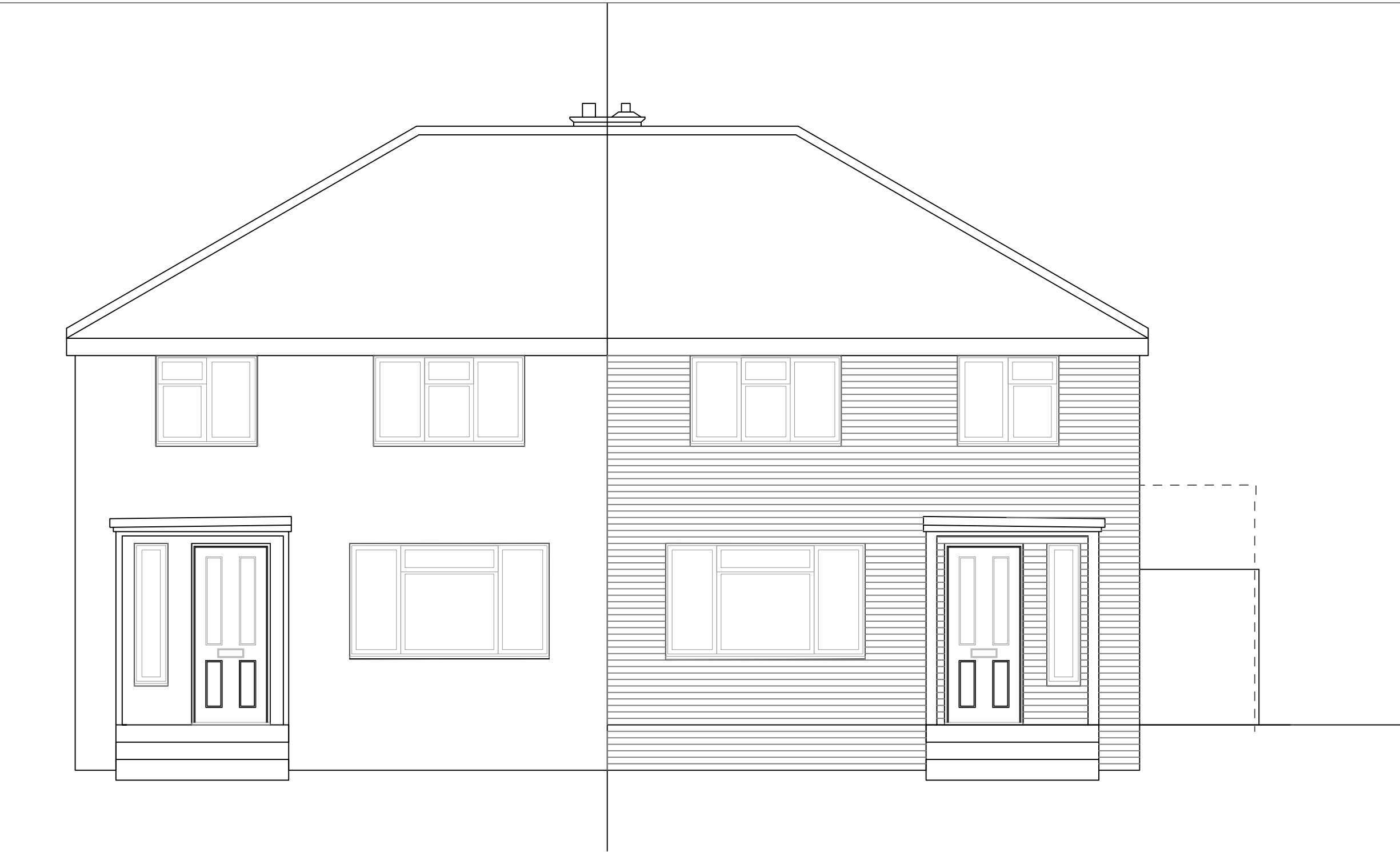
PROPOSED FRONT (north west) SCALE 1:50