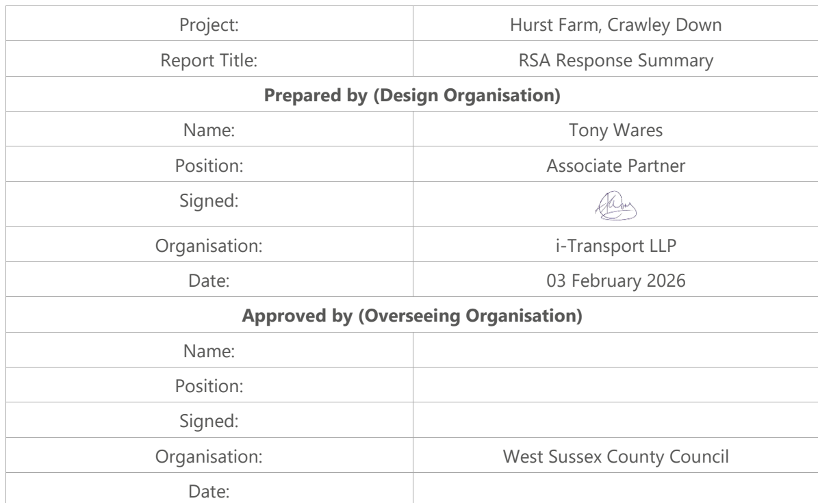
Table F.2: Authorisation Sheet