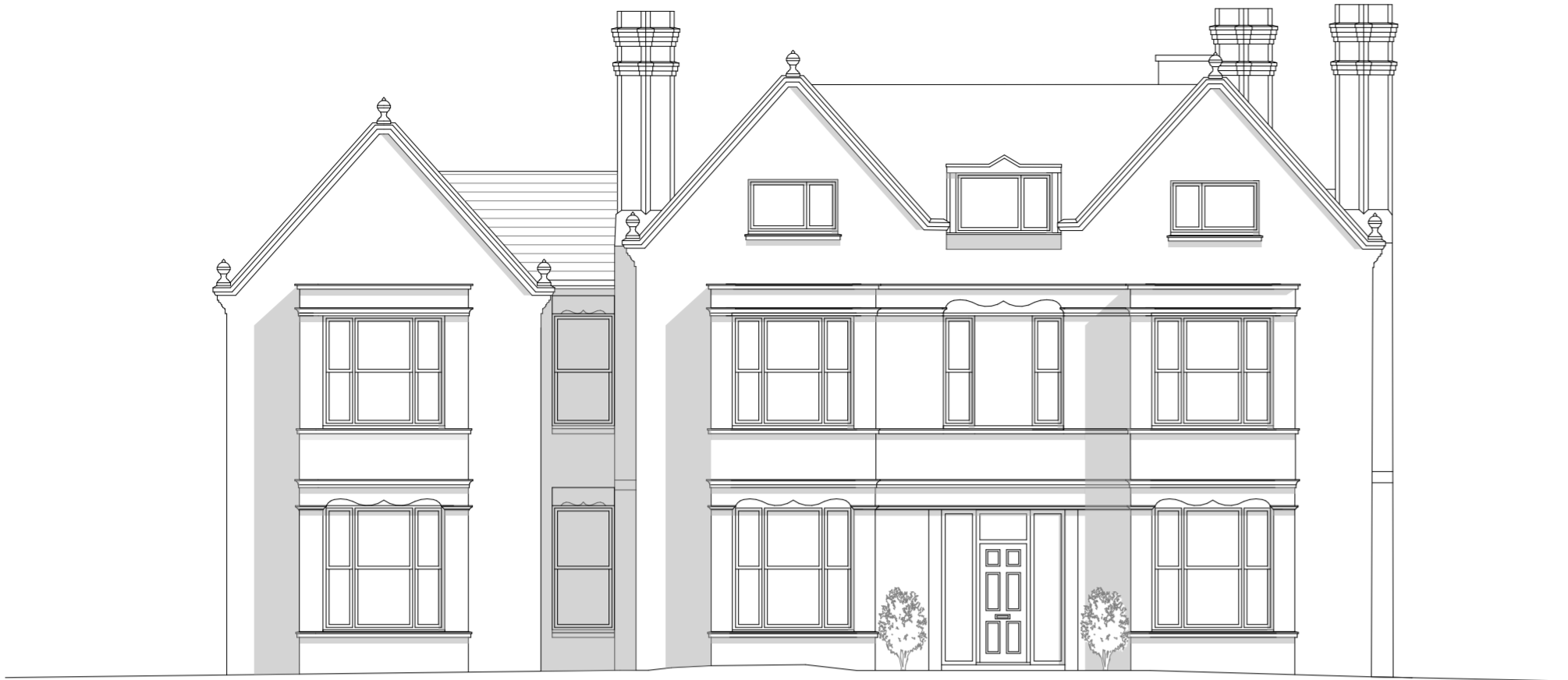
Proposed Front Elevation 1:100