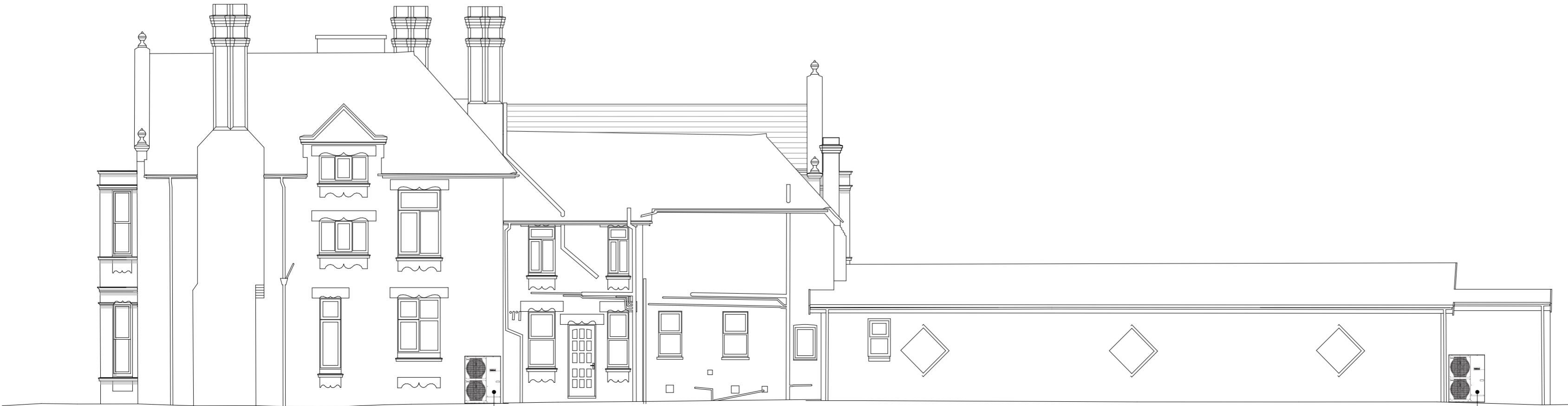
Proposed Side Elevation 1:100

NOTES: ~ Copyright of this drawing remains the property of Buchan Rum Architects Ltd and should not be reproduced in full or parts or re-issued without written permission from Buchan Rum Architects Ltd ~ These drawings must be read in conjunction with the structural engineers drawings & details, and with all other consultants, sub-contractor and specialist's drawings & details. ~ All dimensions are in millimetres, unless stated otherwise. ~ All goods materials workmanship to conform with current building regulations BSS and COP's. ~ All dimensions must be checked on site, and any discrepancies verified with the architect. ~ Do not scale from the drawing ~ Any discrepancies between the drawings, details and specification must be reported to the architect immediately before work is put in hand. ~ All works to be carried out in full accordance with current Building Regulations, British Standards and all Health & Safety Regulations ~ If in doubt please ask.