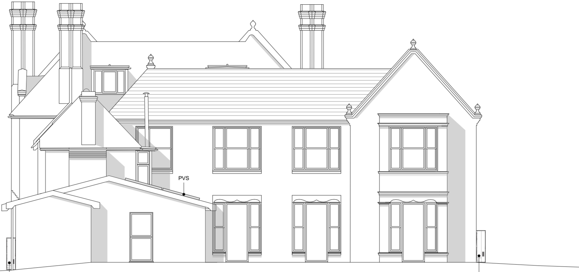
Proposed Rear Elevation 1:100