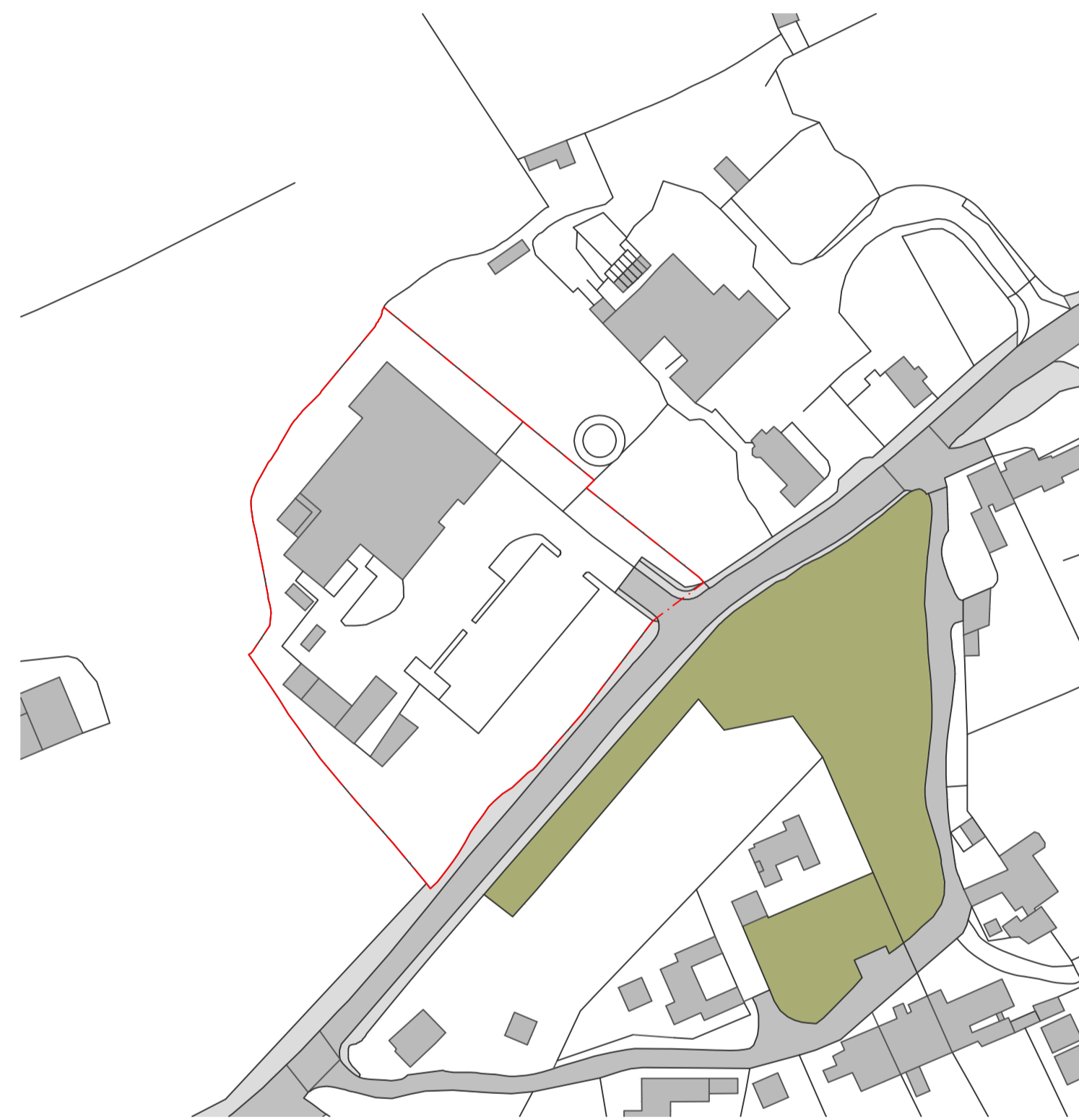
01 EXISTING: SITE LOCATION PLAN 00-0001 SCALE 1:1250

P02 Issued for planning 09/01/26 JG MA P01 Issued for information 15/10/25 JG MA Rev: Description: Date: Drw: Chk: