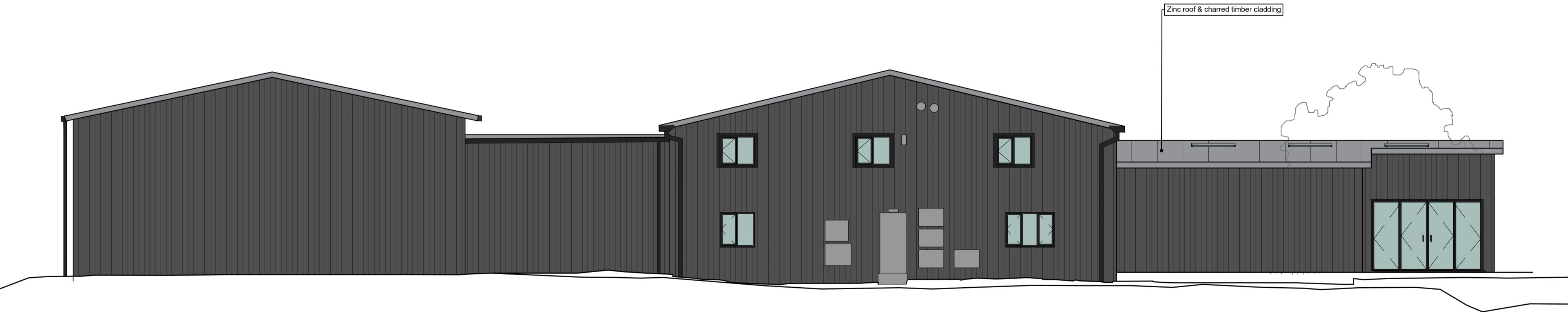
03 ELEVATIONS: REAR (NORTH-WEST) ELEVATION SCALE 1:100