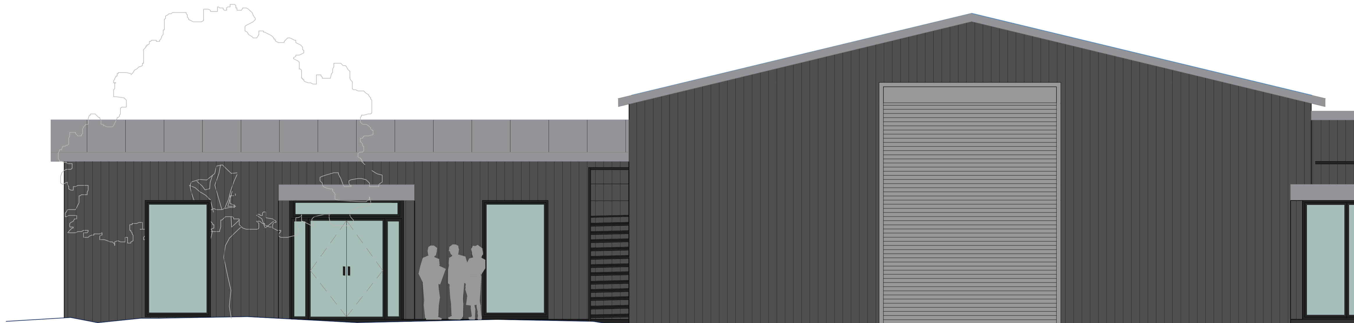
02 FRONT ELEVATION: ROLLER SHUTTERS CLOSED 04-0002 SCALE 1:50