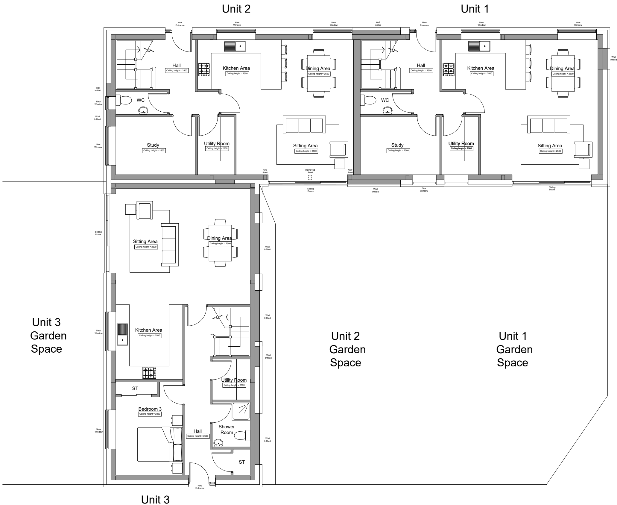
Ground Floor Plan - Proposed Scale 1:100