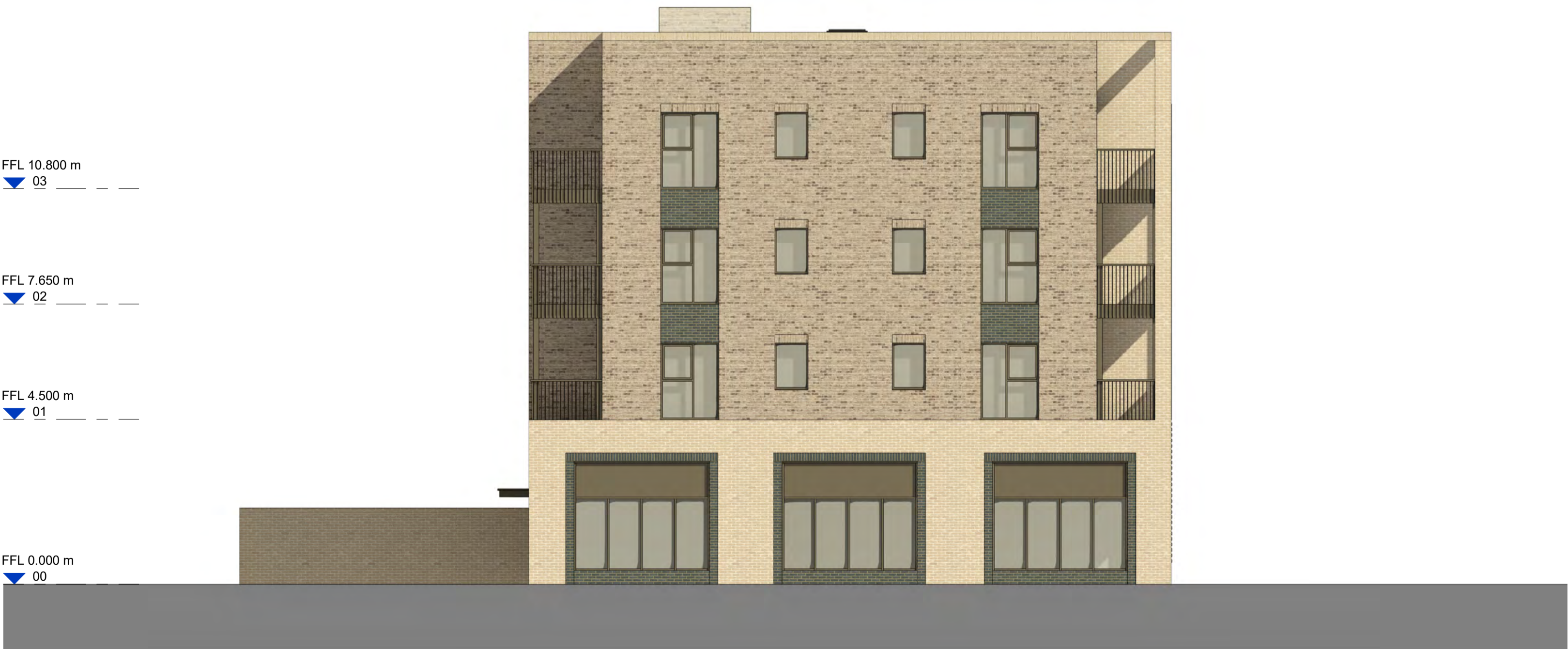
West Elevation 1 : 100

Do not scale from this drawing. All contractors must visit the site and be responsible for taking and checking dimensions. All construction information should be taken from figured dimensions only. Any discrepancies between drawings, specifications and site conditions must be brought to the attention of the supervising officer. This drawing & the works depicted are the copyright of JTP.