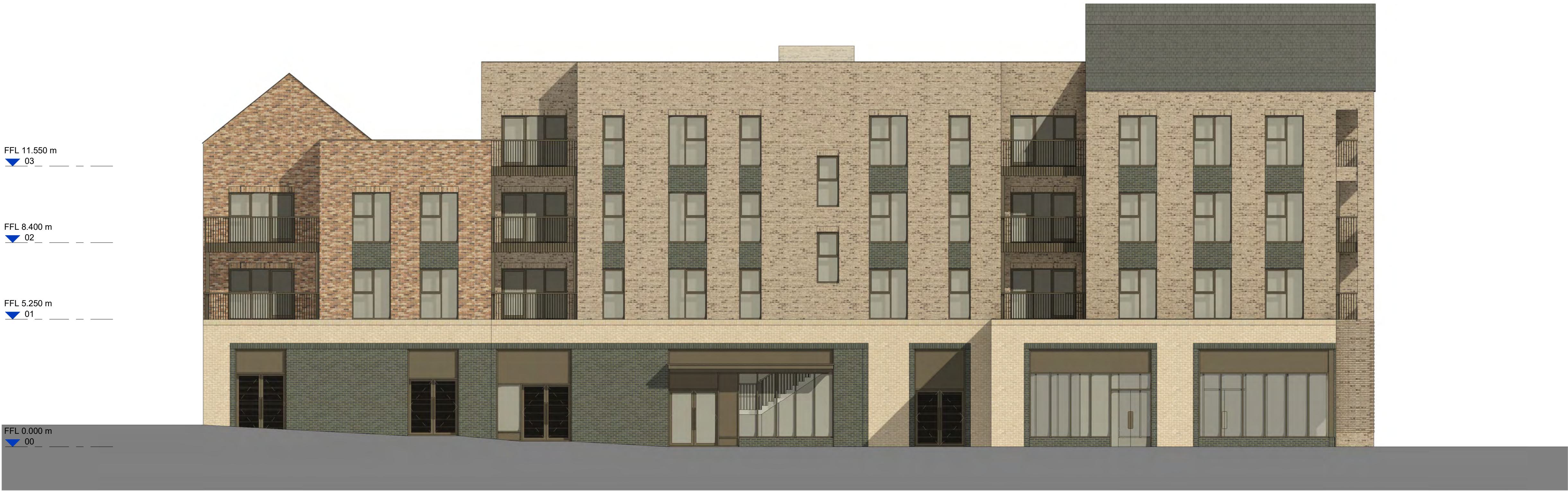
West Elevation 1 : 100

Notes Do not scale from this drawing. All contractors must visit the site and be responsible for taking and checking dimensions. All construction information should be taken from figured dimensions only. Any discrepancies between drawings, specifications and site conditions must be brought to the attention of the supervising officer. This drawing & the works depicted are the copyright of JTP. This drawing is prepared for the specific project stage in the Drawing Status section below and it is not intended to be used for any other purpose. Whilst all reasonable efforts are used to ensure drawings are accurate, JTP accept no liability for any reliance placed on, or use made of, this plan by anyone for purposes other than those stated in the Drawing Status below.