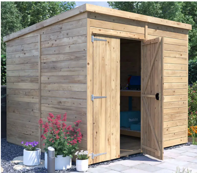
Example of timber shed