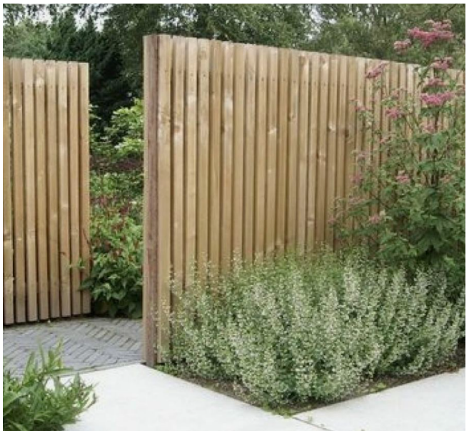
Example of fencing with planting