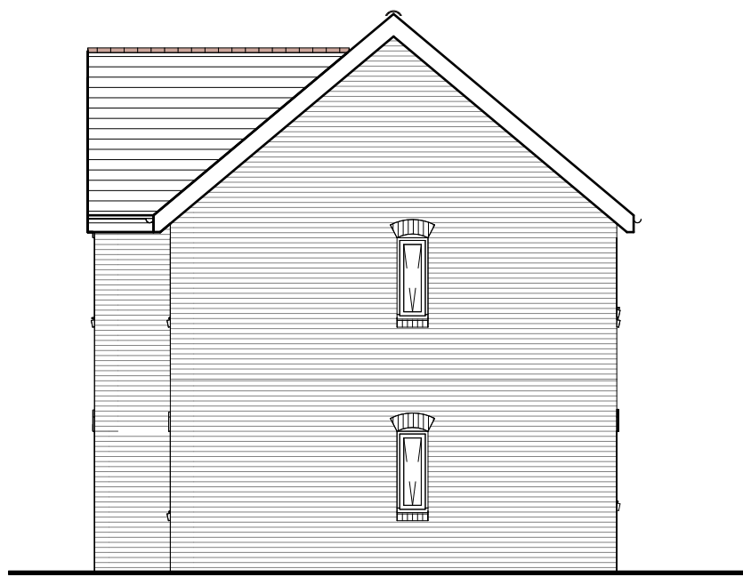
Side 2 Elevation