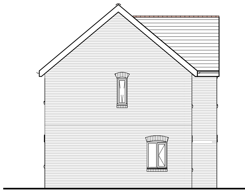
Side 1 Elevation