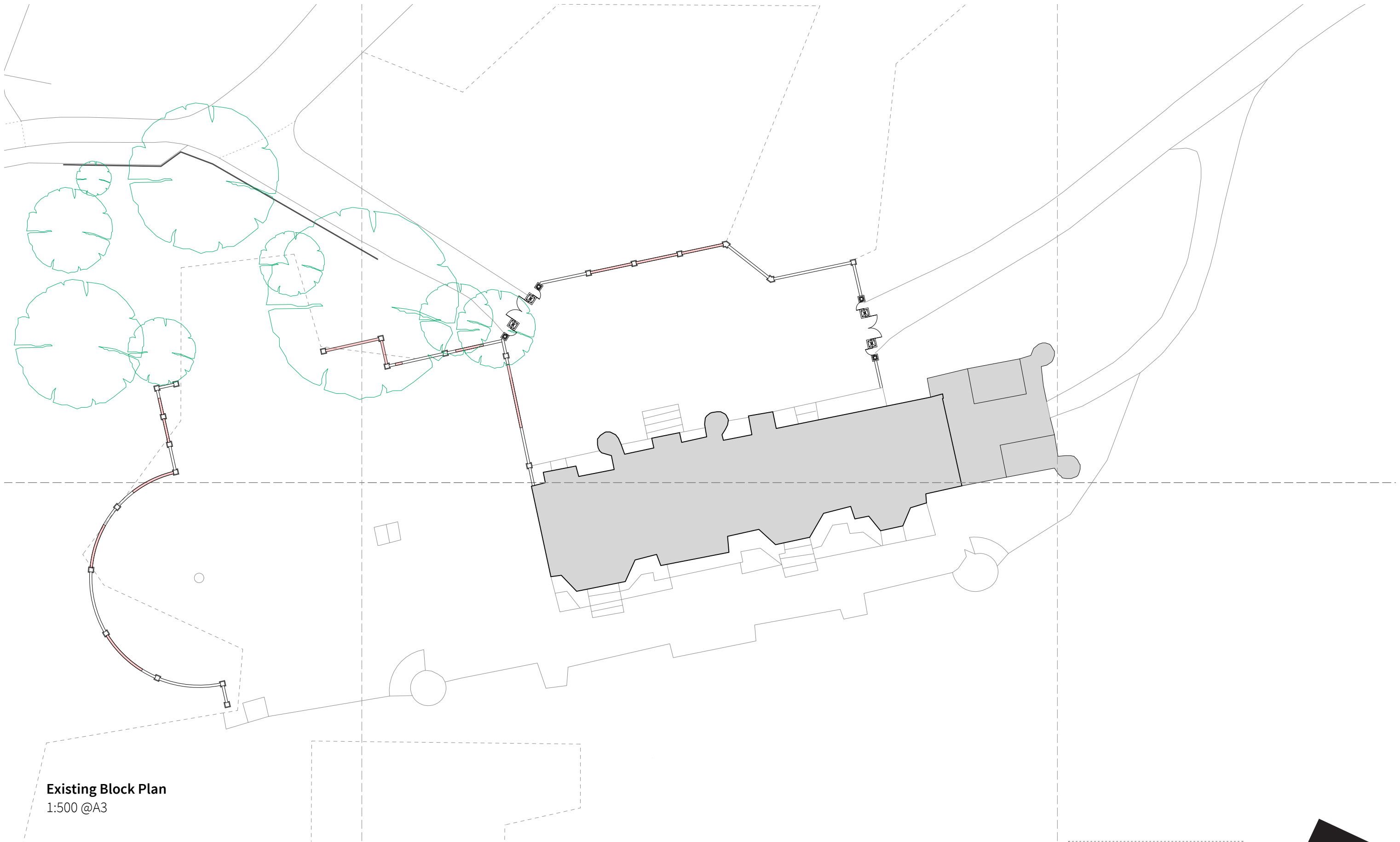
Existing Block Plan 1:500 @A3

23 Vine Street, Brighton BN1 4AG e: studio@sticklandwright.co.uk t: 01273 964051 Company registered in England No. 11222477