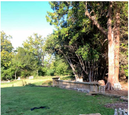
View looking along garden wall towards area new screened plant is proposed as red arrow on plan.