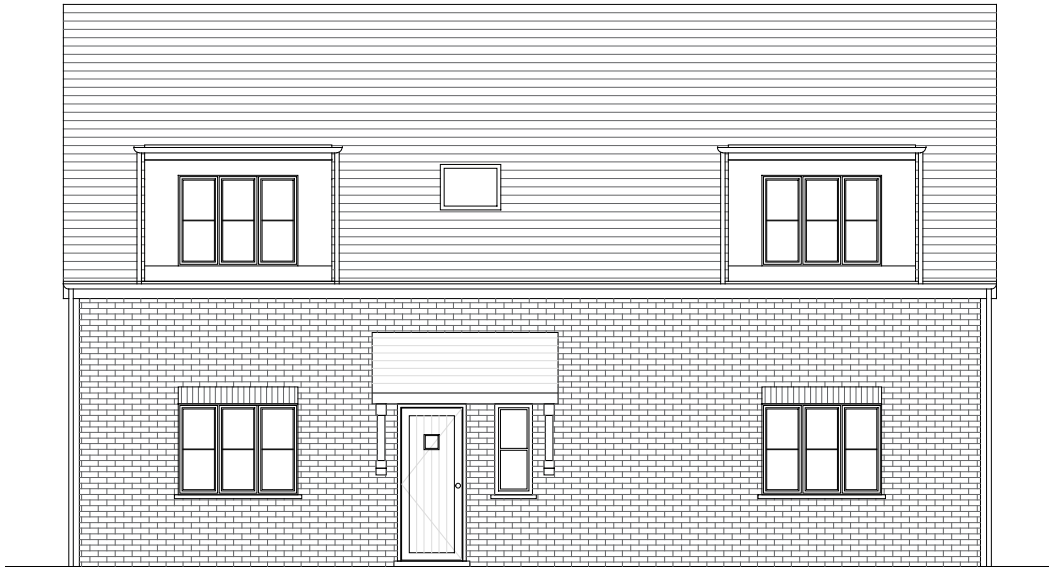
01 Elevation A Scale 1:100