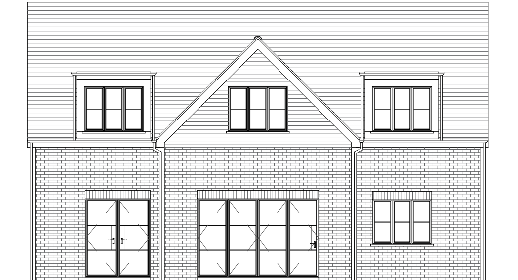
03 Elevation C Scale 1:100