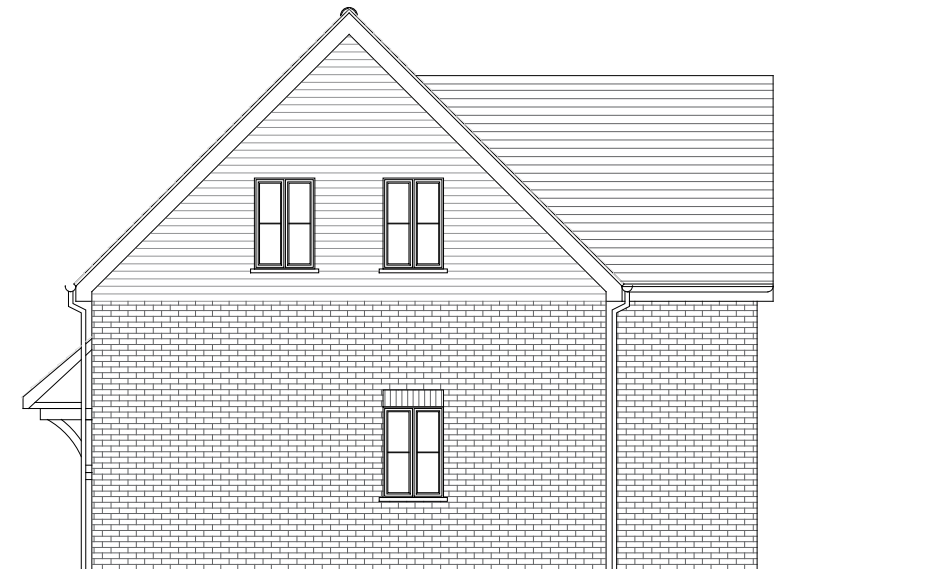
04 Elevation D Scale 1:100