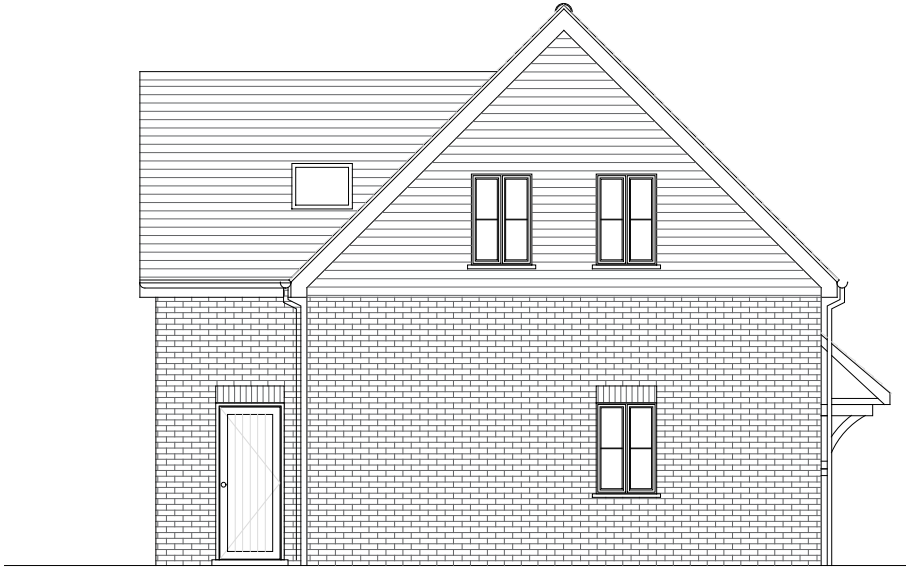
02 Elevation B Scale 1:100