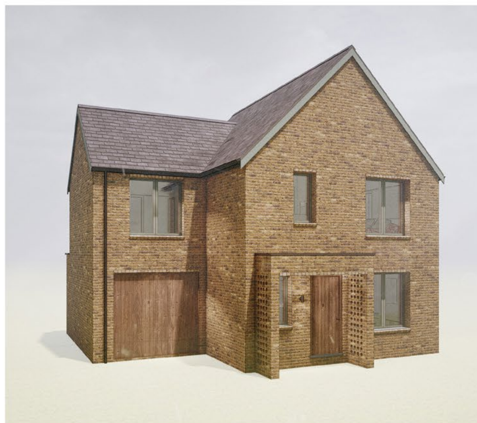
HOUSE TYPE CONCEPT