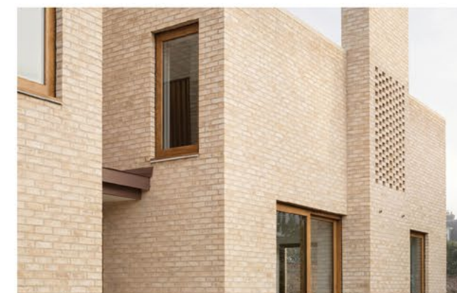
BUFF BRICK & PERFORATION