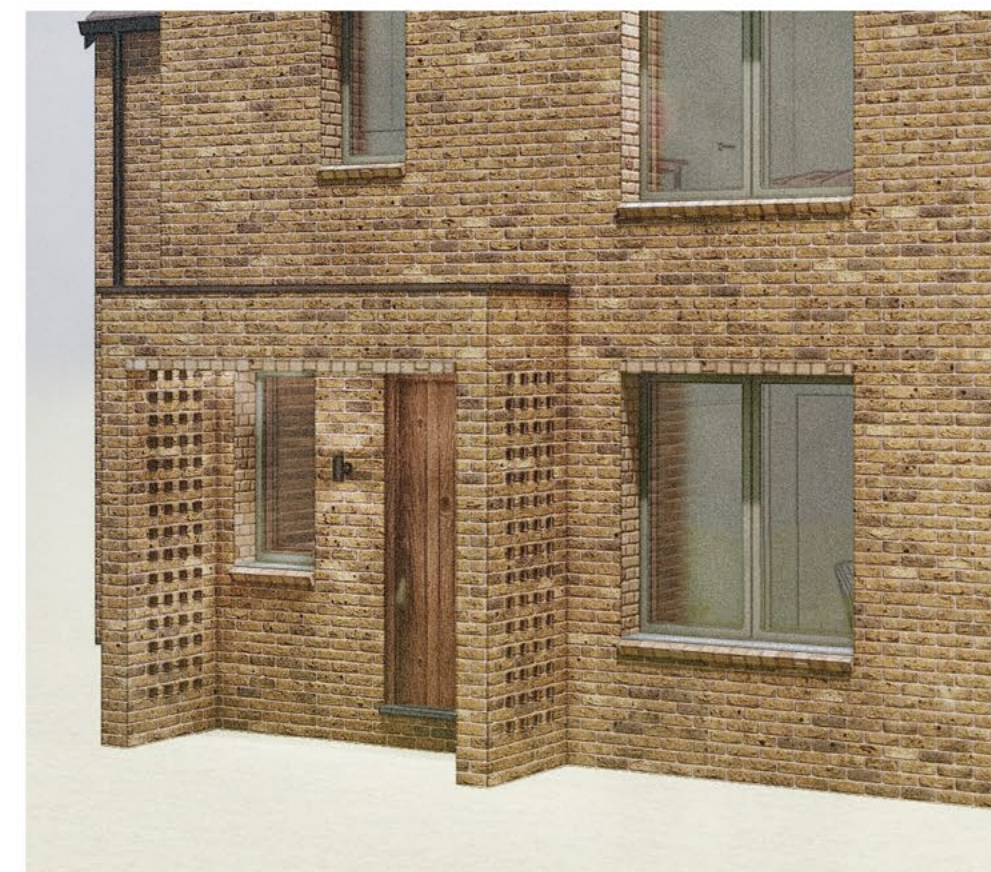
HOUSE TYPE CONCEPT