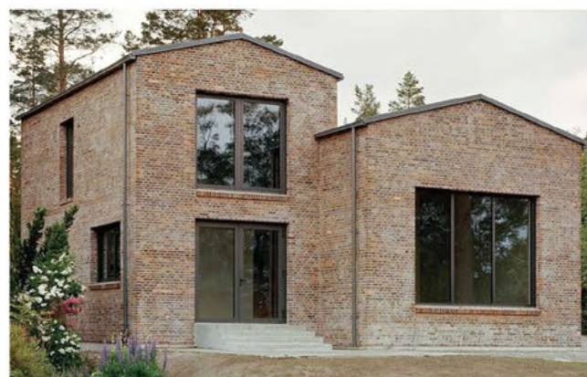
BEDDED EAVES, WINDOW DETAILING & DEEP REVEAL

The traditional materials in Crawley Down reflect those of the wider Sussex region: red brick, timber framing, and weatherboarding, often with clay-tiled or slate roofs. However, there are multiple contemporary homes in the area which gives the opportunity to do something similar on this site.