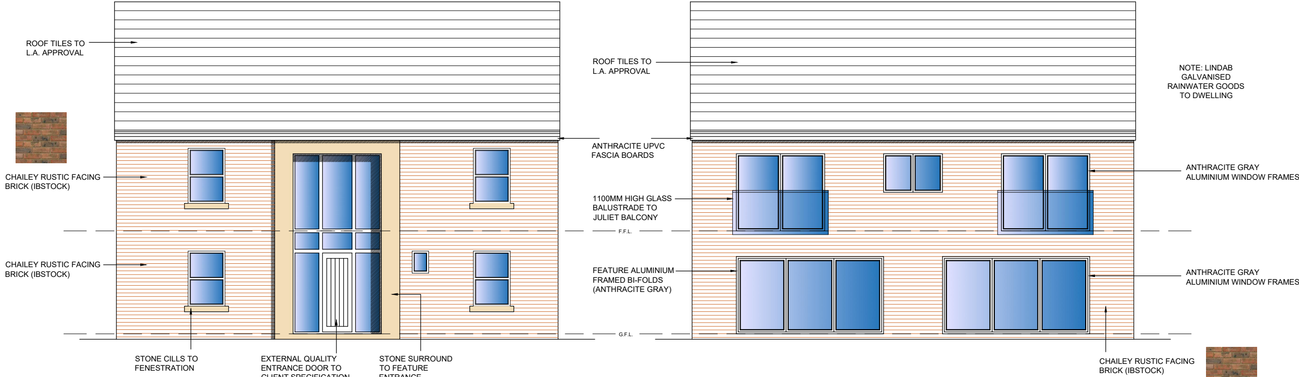
PLOT TWO PROPOSED FRONT ELEVATION