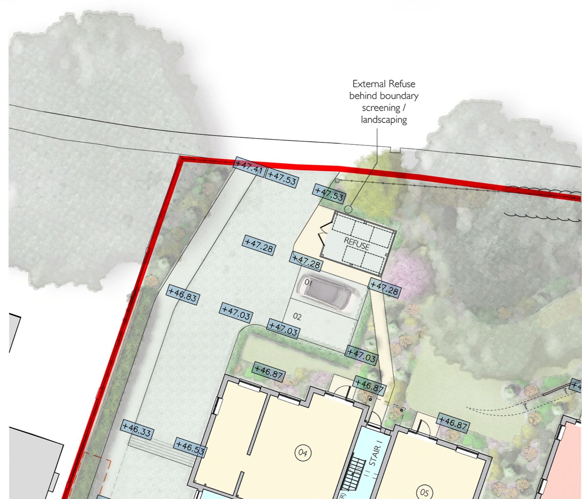
GROUND FLOOR PLAN_scale 1:100