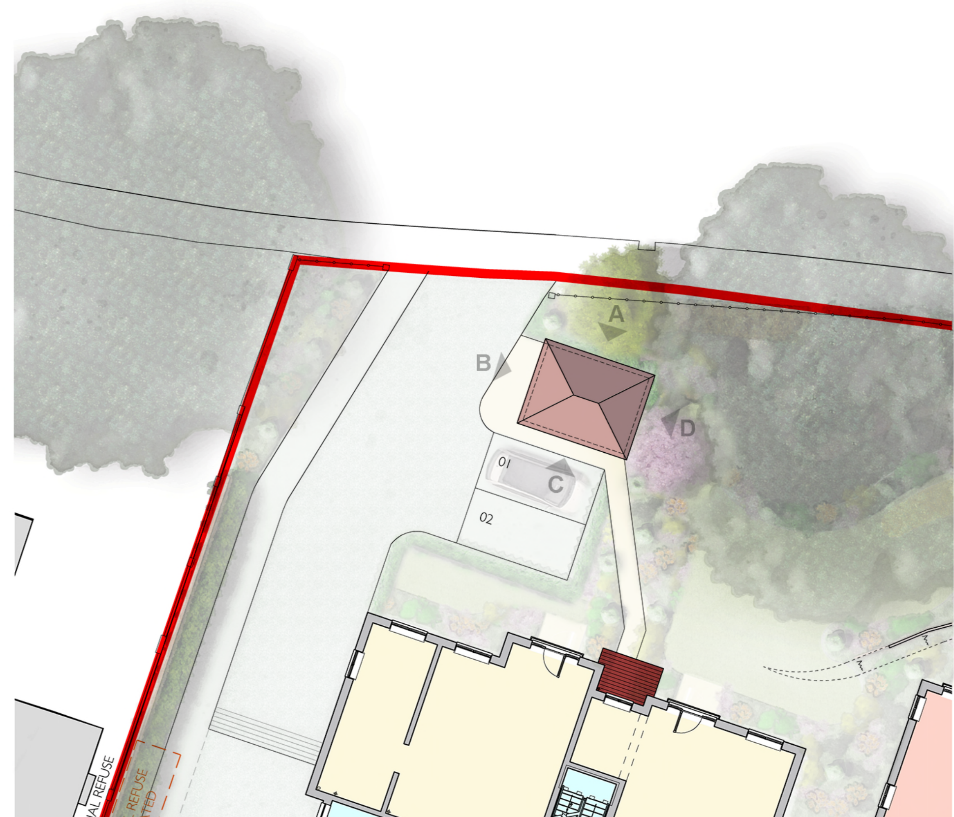
ROOF PLAN_scale 1:100