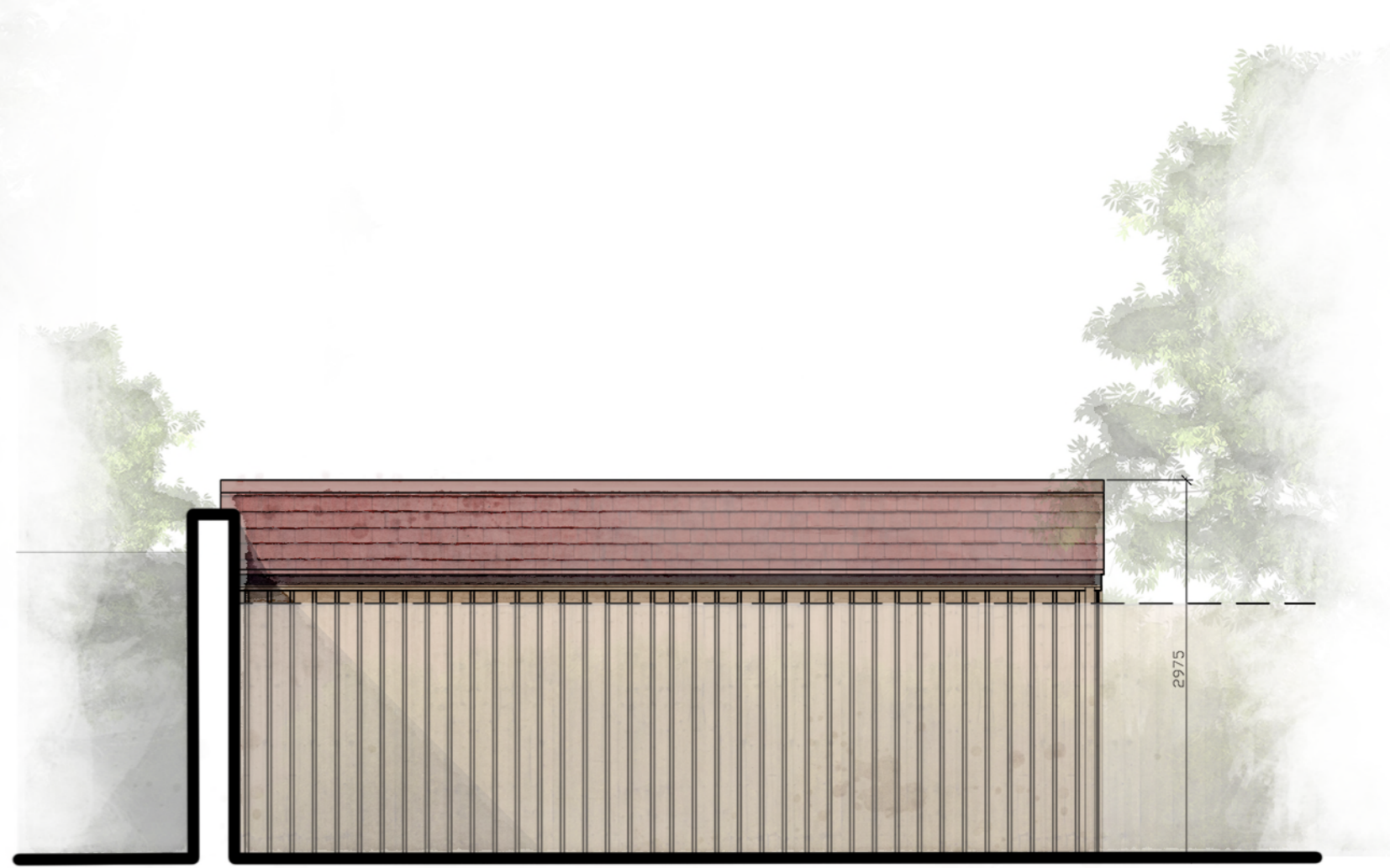
ELEVATION D_scale 1:50