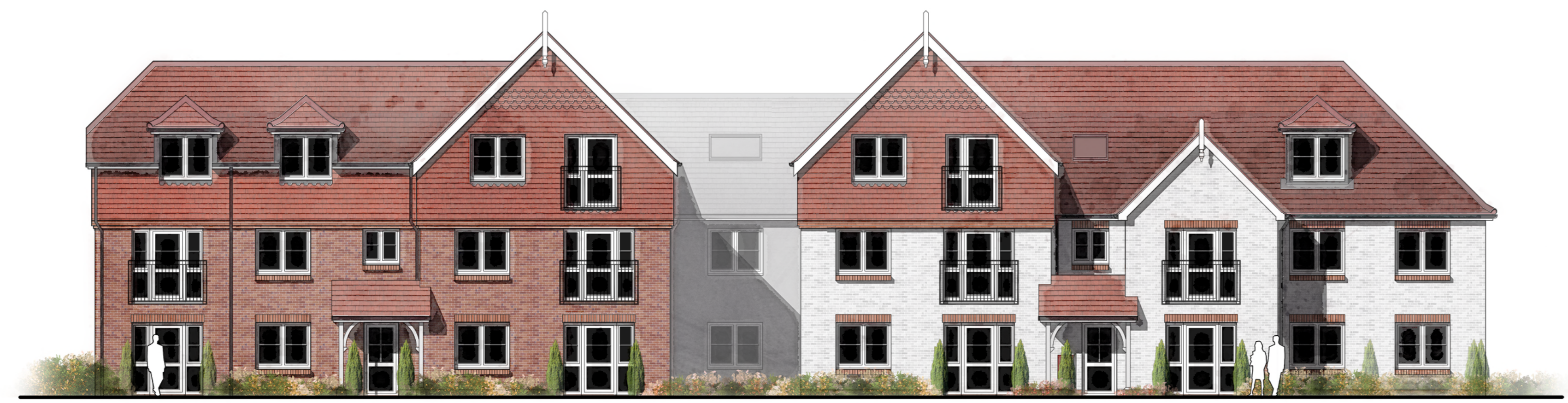
ELEVATION AA_scale 1:100