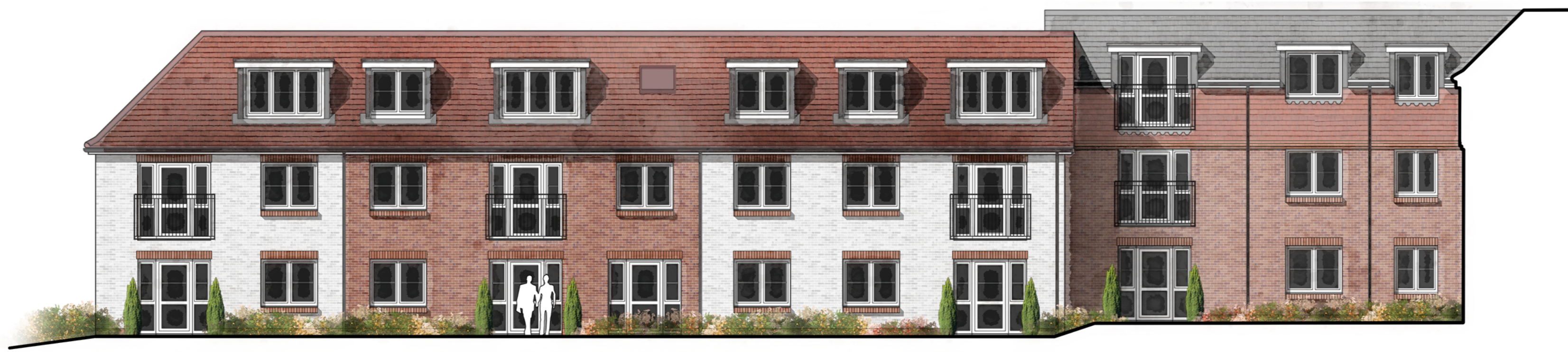
ELEVATION D-D1_scale 1:100