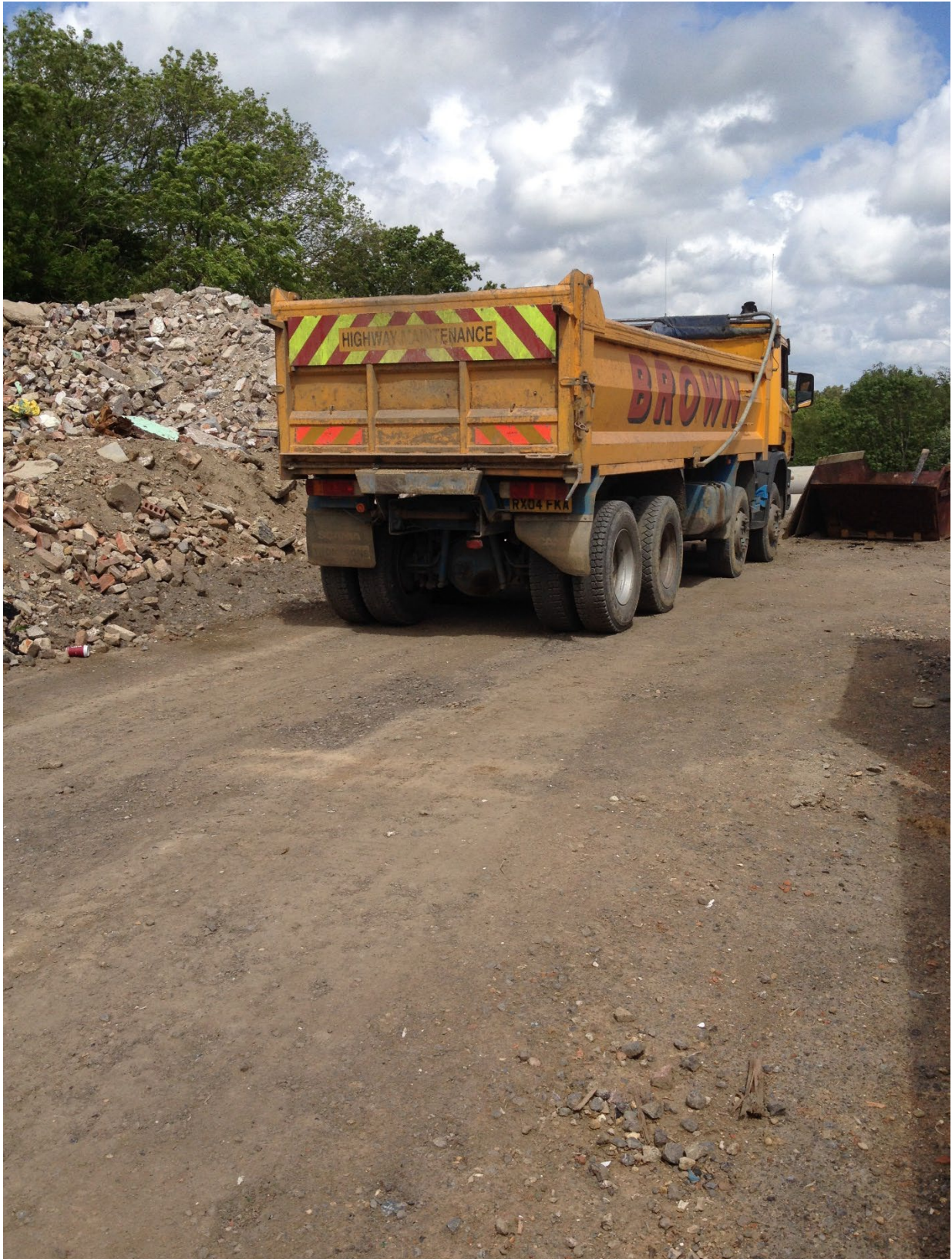
RX04FKA in Bolney compound next to large stockpile of material awaiting crushing.