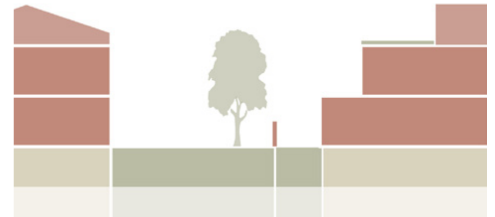
Fig 10.11 Constrained sites - innovative design solutions can overcome overlooking issues where the geometry or area of a site is constrained to the point where standard minimum back-to-back distances for private amenity are not possible.

Building setbacks, roof terraces and no habitable rooms at rear of first floor enables closer proximity between dwellings while avoiding overlooking into neighbouring gardens.