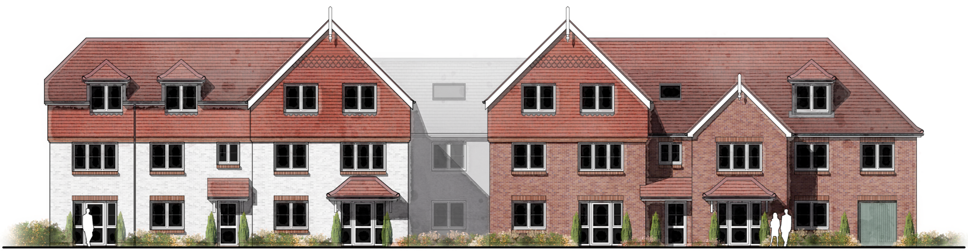
ELEVATION AA_scale 1:100